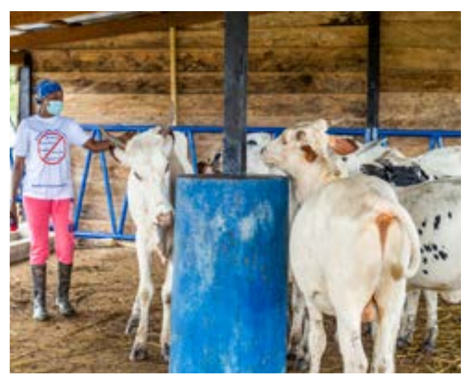
The cattle ranch in Mpuasu

n October 2021, the International Organizatio for Migration (IOM) in Ghana, together with GIZ Ghana and thanks to local support from the NGO BOK Africa Concern, handed over four community-based reintegration (CBR) projects in the Bono region. These projects bring together returnees and community members – contributing to the development of the communities, supporting returnees to re-establish themselves sustainably, and reducing stigmatization.