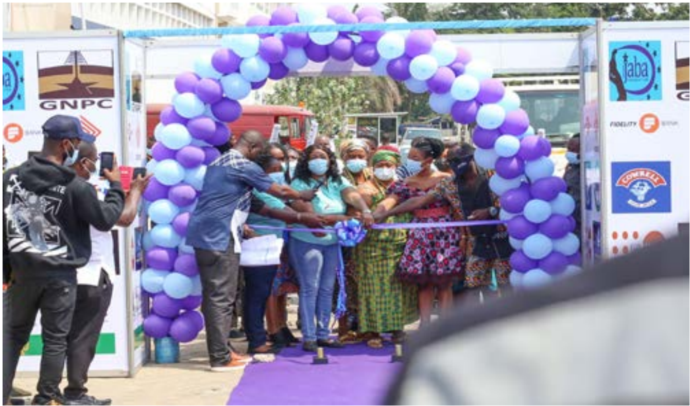
Officials cut the ribbon to the exhibition stand.

Participating in the two-day event were a range of institutions including: The Dzorwulu Special School, Autism Awareness Centre and Akuropong School for the Blind. Read more.