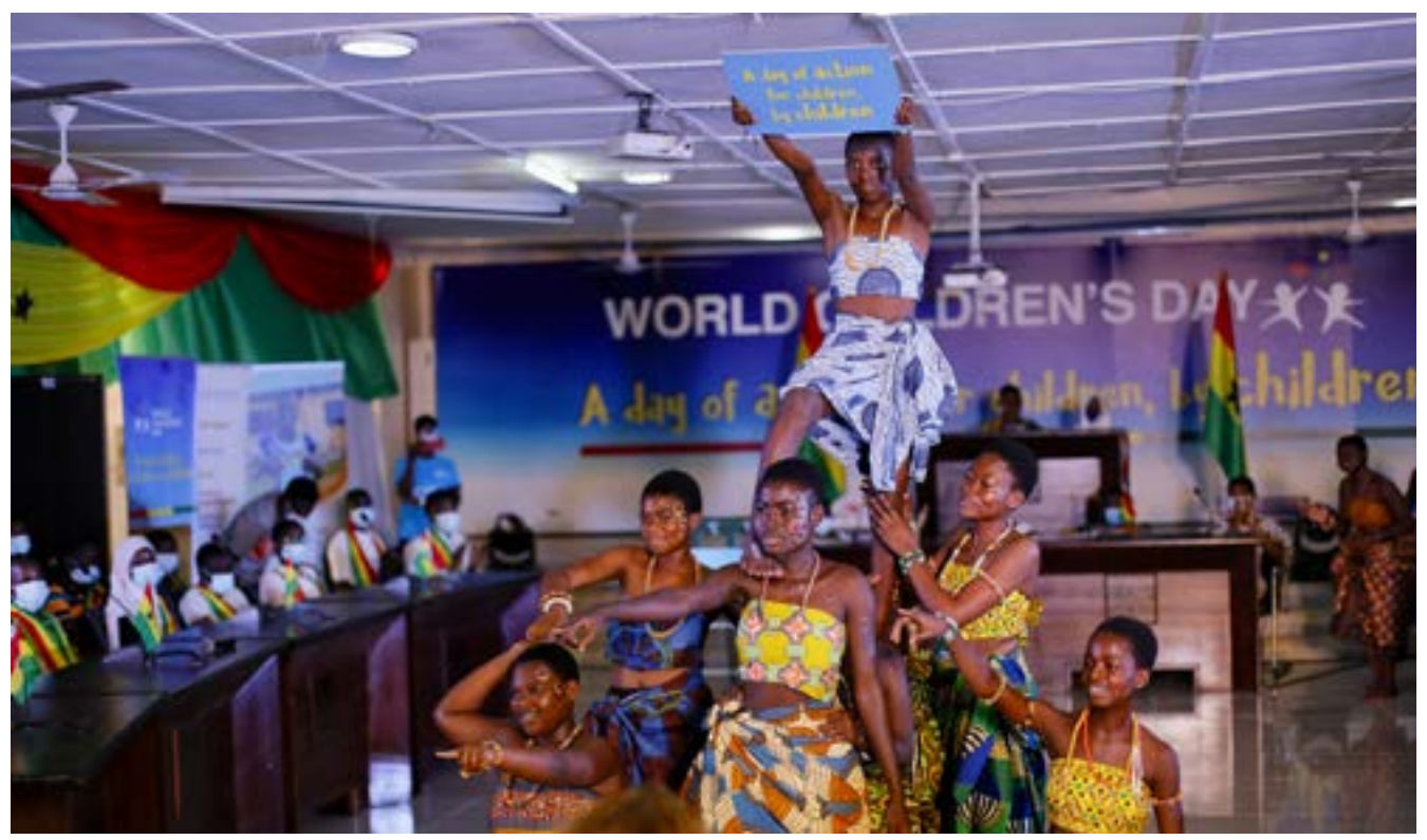
Children performance during the official event to mark World Children's Day.

UNICEF later unveiled a mural on its premises to illustrate the need for a conducive environment and care for every child.