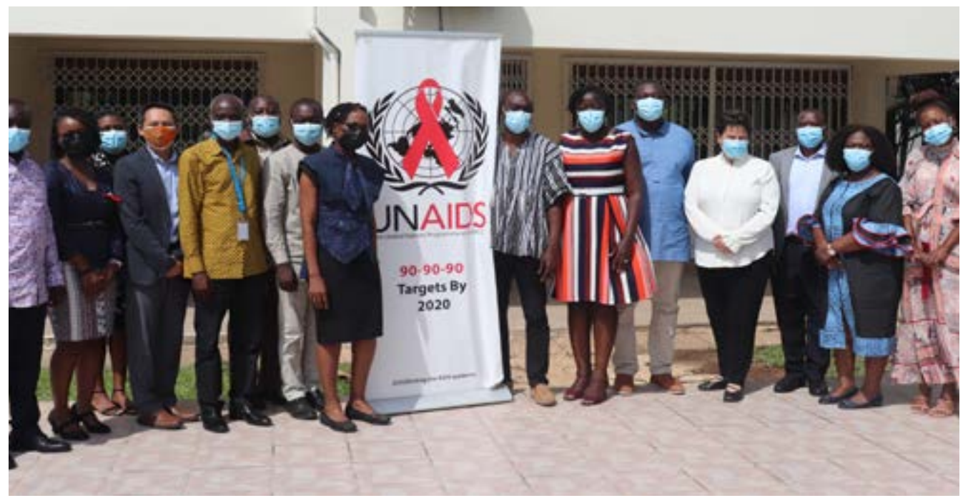
Participants at the Differentiated Service Delivery (DSD) Strategic Initiative for HIV Launch