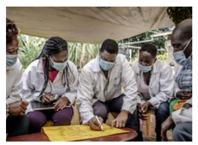
Health experts discussing the One Health approach

One Health is an integrated approach for preventing and mitigating health threats at the animal, human, plant, and environment interface to achieve public health, food and nutrition security, sustainable ecosystems and fair-trade facilitation. The Day recognizes that animal, human, plant, and environmental health are connected. Read more.