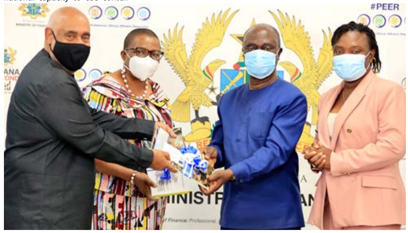
The UN handing over Infrastructure Financing Strategy (IFS) report to the Ministry of Finance at the project closeout event in Accra.

country's Nationally Determined Contributions (NDCs). The Sustainable Infrastructure Financing Tool (SIFT) is a cutting-edge tool that assists governments in identifying evidence-based sources of infrastructure financing. Read more.