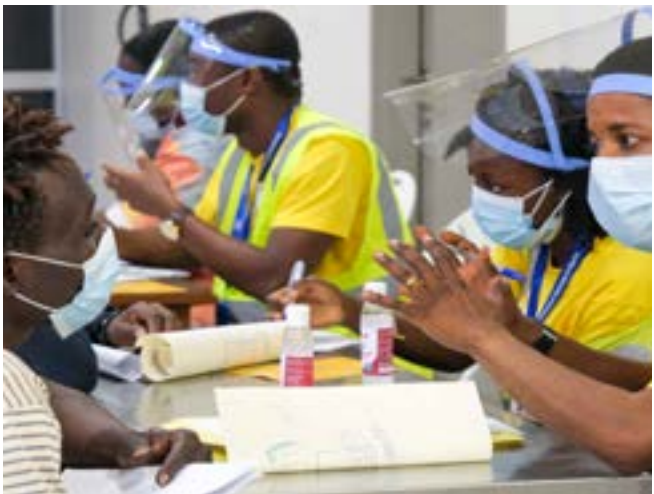
IOM officials engaging some of the returnees