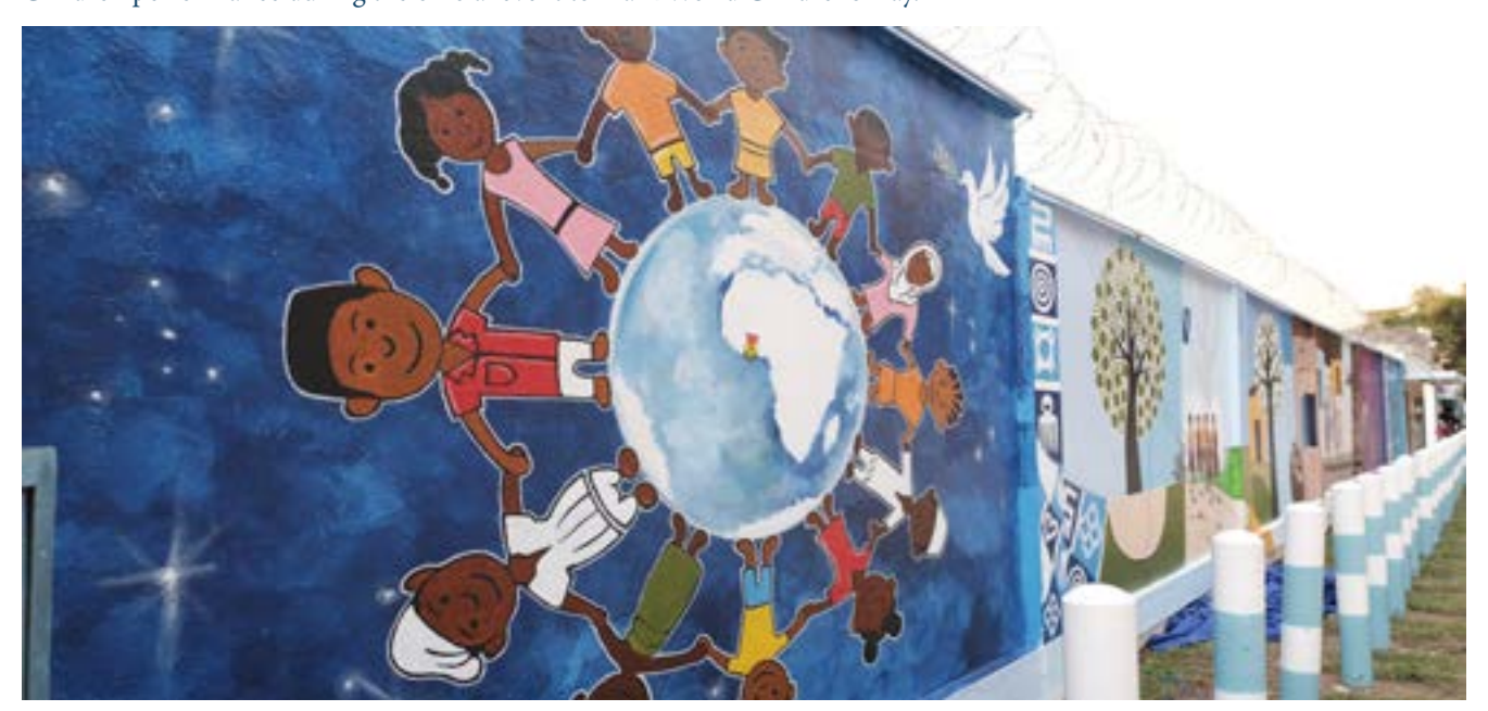
The mural on the walls of the UNICEF Ghana office.