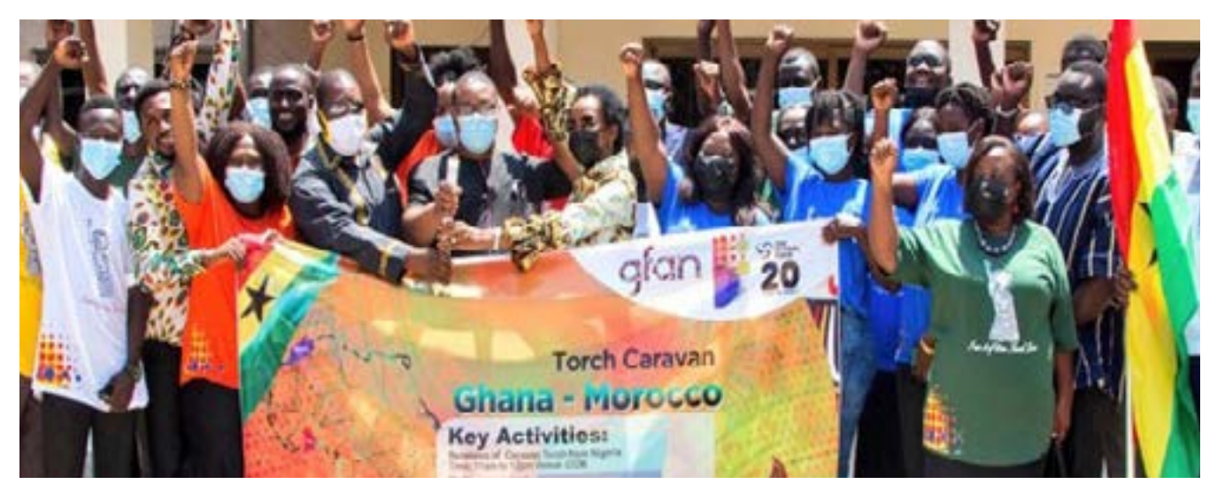
Group photo with the Global Fund at 20 torch