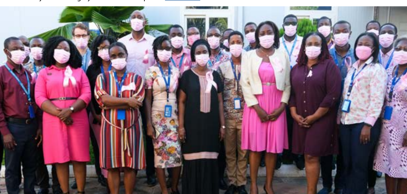
IOM Ghana staff in pink ribbon

Find out more about <u>IOM Ghana's psychosocial</u> <u>support</u>, collaborations with Government and other migration stakeholders, and how this helps Ghanaian returnees to rebuild their lives in this video statement