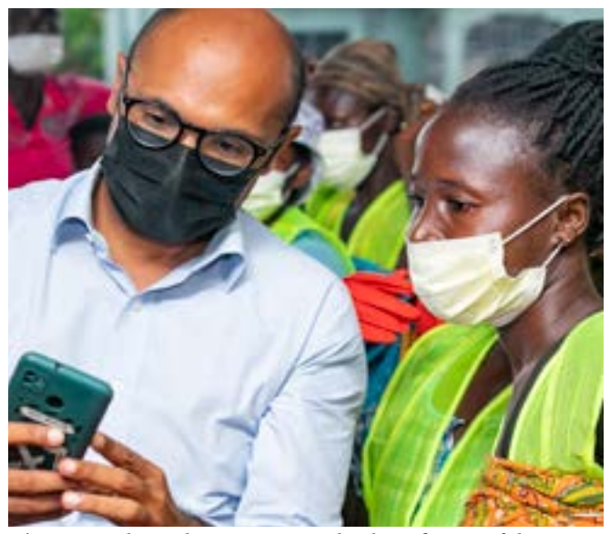
The EU Ambassador interacts with a beneficiary of the GrEEn Project, Cash for Work activity.

The field visit was to afford the EU Ambassador, who assumed office in September, the opportunity to see at first hand some of the UN interventions being funded by the EU and to explore further partnership for future collaboration. Read more.