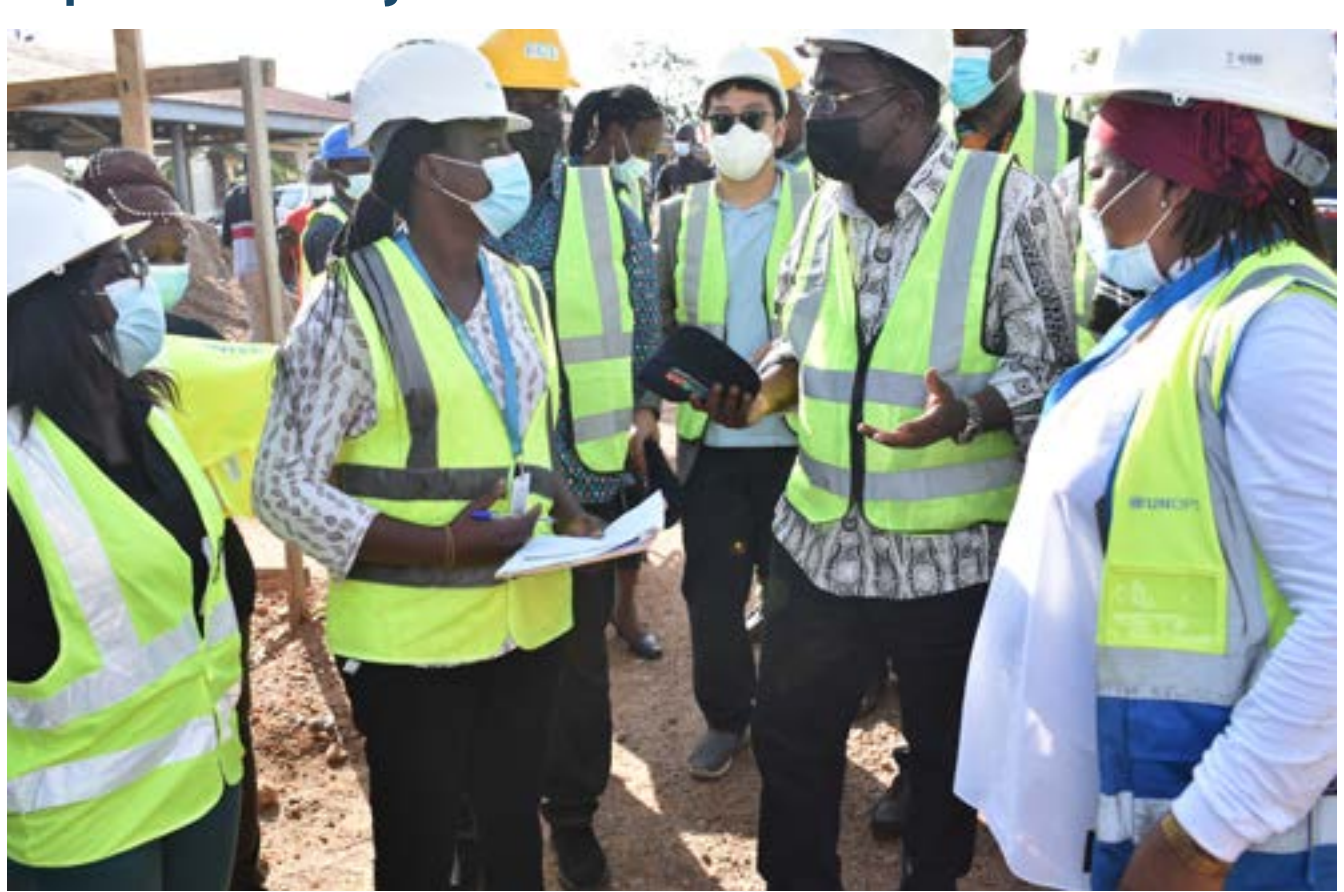
UNOPS staff briefing the Minister and his entourage on the activities being implemented by UNOPS

NOPS, together with the Korea International Cooperation Agency (KOICA) and the Ministry of Food and Agriculture (MoFA) visited a "Rice Value Chain (RVC) Improvement Project" site in Okyereko, Ghana. The RVC project is part of a wider KOICA programme being funded by the KOICA and implemented by UNOPS and MoFA aimed at increasing rice