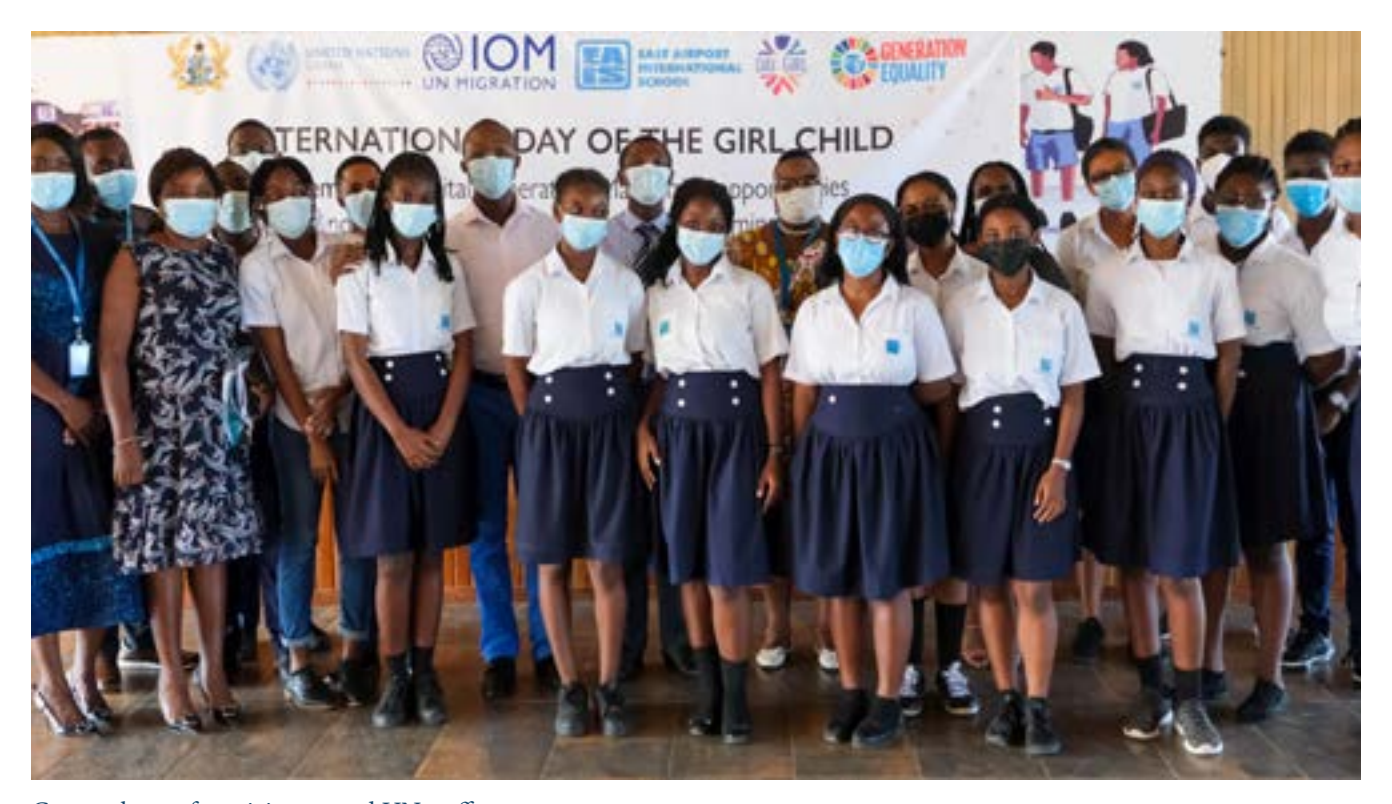
Group photo of participants and UN staff

the UN Capital Development Fund (UNCDF) also took the students through career options for young women and girls in STEM.