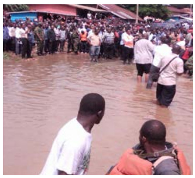
Flood in Accra.

Despite increase in disaster risks, protection gaps persist, and COVID-19 has further exposed the extent of vulnerability. To identify challenges, opportunities, and solutions to increase inclusive insurance and risk financing towards the achievement of the Sustainable Development Goals (SDGs), UNDP commissioned a diagnostic study. This was supported by the UNDP's Insurance and Risk Financing Facility, which is a flagship initiative of UNDP's SDGs Finance Sector Hub and a product of a Tripartite agreement between UNDP, Insurance Development Forum, and the German Government. Read more