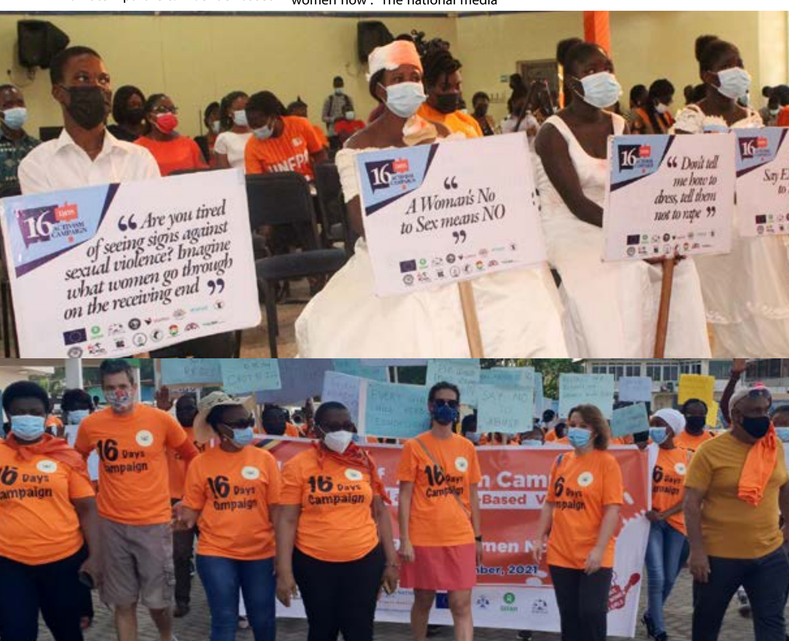
TOP: cross section of the audience at the launch holding placards with insription calling for an end to gender-based violence. ABOVE: Heads of UN officials and partners leading the walk against gender-based violence.

launch of the period took place on November 24 in Accra. In support of the United Nations in Ghana #NoManels initiative, the over 200 audience at the event took a pledge to drive the campaign of ensuring the participation and representation of women at meetings and processes in Ghana. Read more.