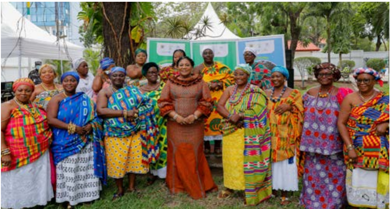
H.E. Rebecca Akufo-Addo with queen mothers during a Community Mobilization Engagement on improving nutrition for children and adolescents.

What’s more, UNICEF also supported the Ministry of Health, GHS and H.E. the First Lady, Mrs. Rebecca Akufo-Addo, to engage Queen Mothers, other traditional leaders and young people who have the power to mobilize society and advocate for increased uptake of the Girl’s Iron Folate Tablet Supplementation and other nutrition programmes.