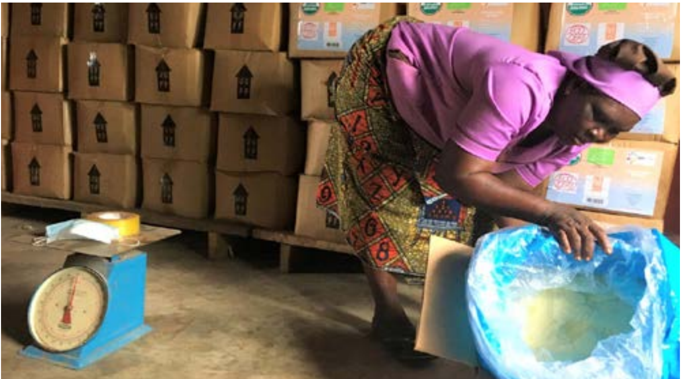
Shea butter packaged by the women for export.

To promote fair trade certification for products made by Ghanaian women in the shea butter industry, UNDP, through the Global Environment Facility Small Grants Programme (GEF-SGP), is supporting a project that is being implemented by Ripples Ghana. [Read more.]