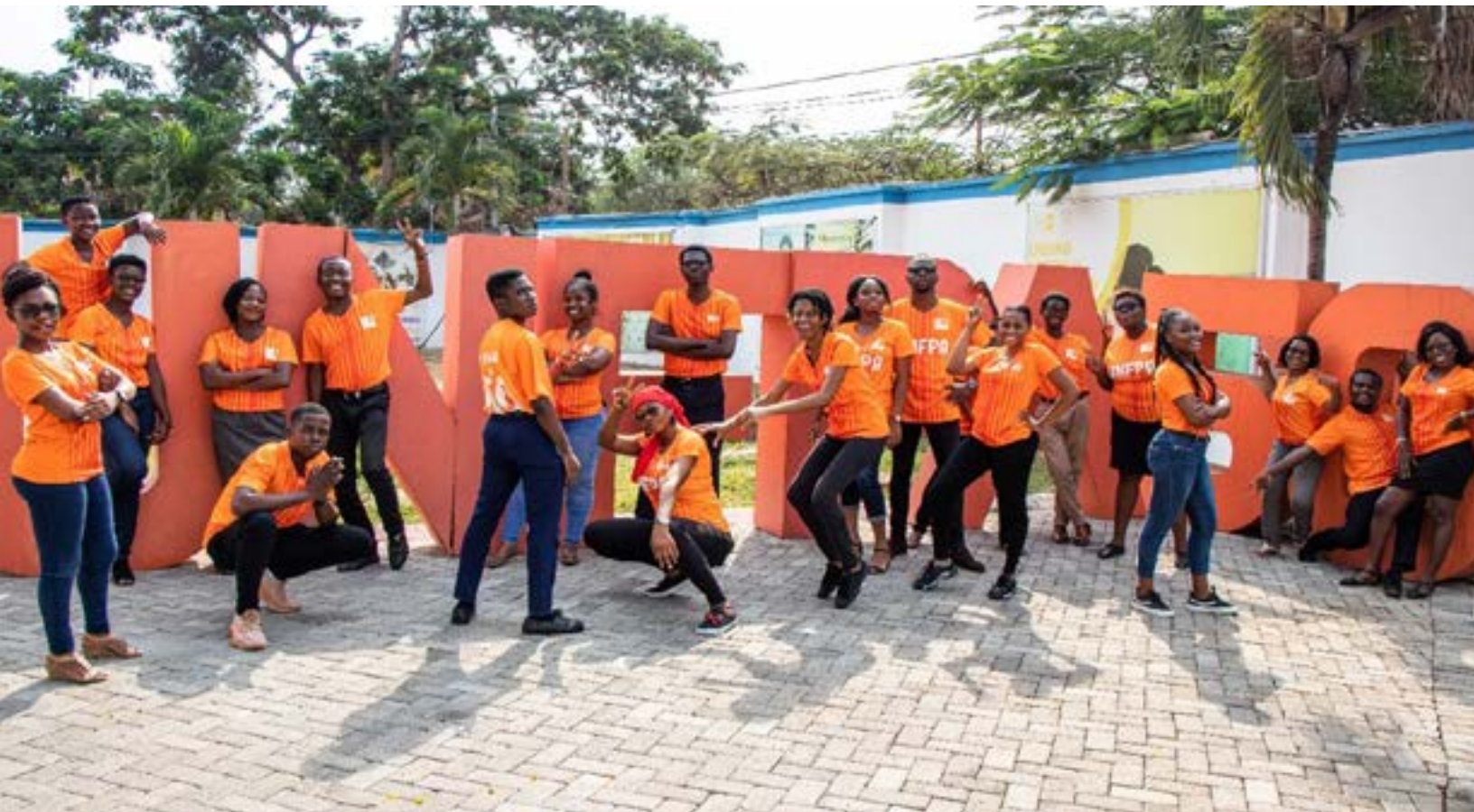
Fellows of the Second Cohort of YoLe.

The third cohort is in for something life-changing, they are buckled up and are ready for the take off.