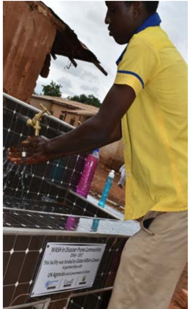
A resident washing his hands at a handwashing station built for the Ward K community.