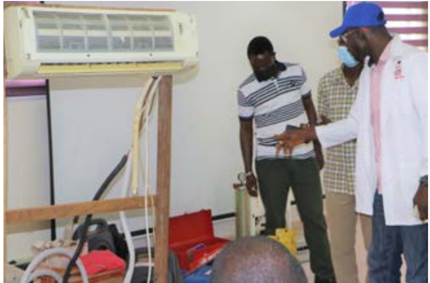
Technicians being taken through practical sessions at the training

To consolidate the success achieved and continue to meet other obligations under the Montreal Protocol on Substances that Deplete the Ozone Layer, UNDP supported the Environmental Protection Agency (EPA) to organize a series of trainings for technicians in the refrigeration sector.