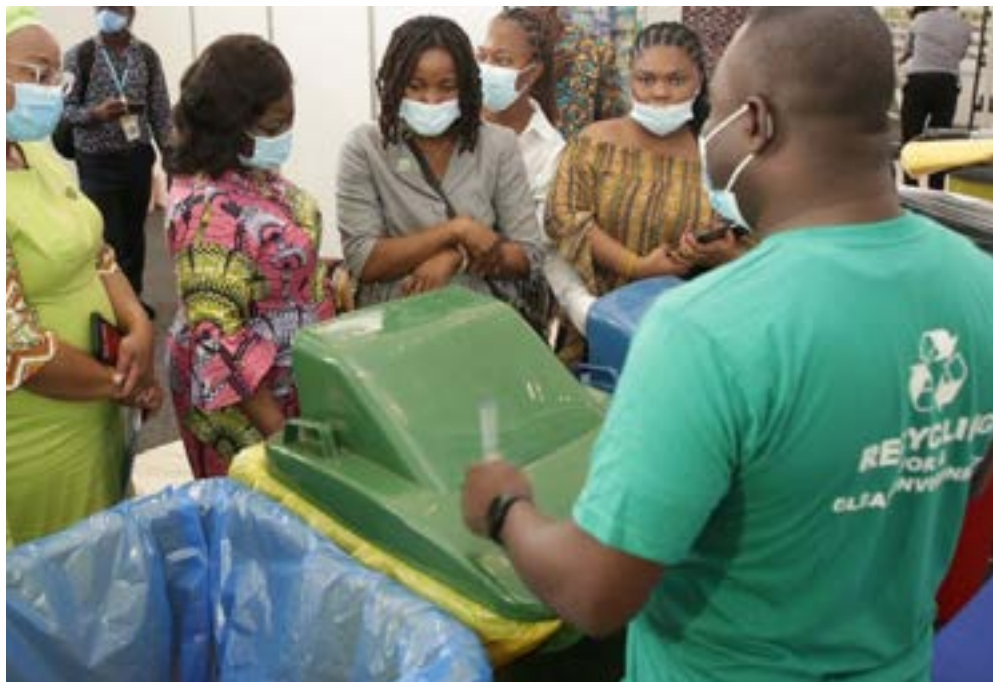
A participant at the Fair explaining his exhibit to officials at his stand.

The Fair brought together over 300 stakeholders to dialogue and share ideas on how innovation can be leveraged to promote sustainable waste management in Ghana. [Read more.]