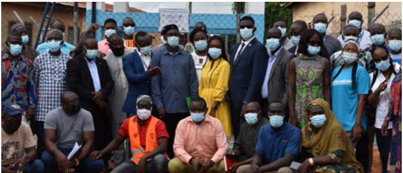
Group picture of visiting UN officials, partners and residents of Ward K.