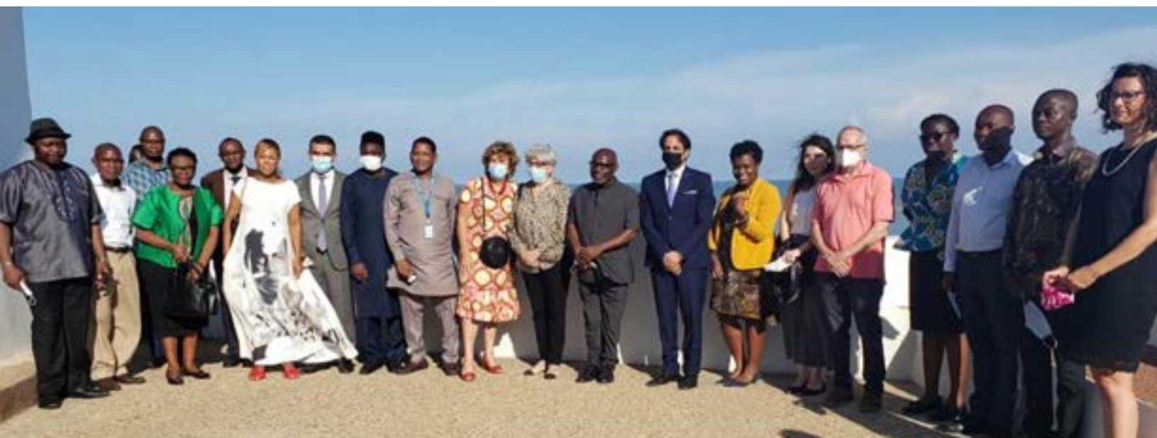
Members of the diplomatic community at the Fort