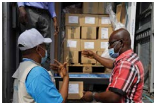
Vaccines ready to be transported for storage.