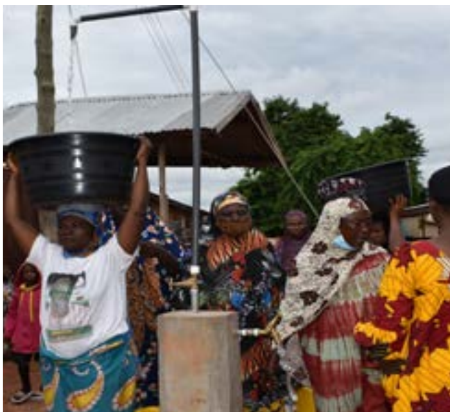
A woman fetches from a water station built for the community.