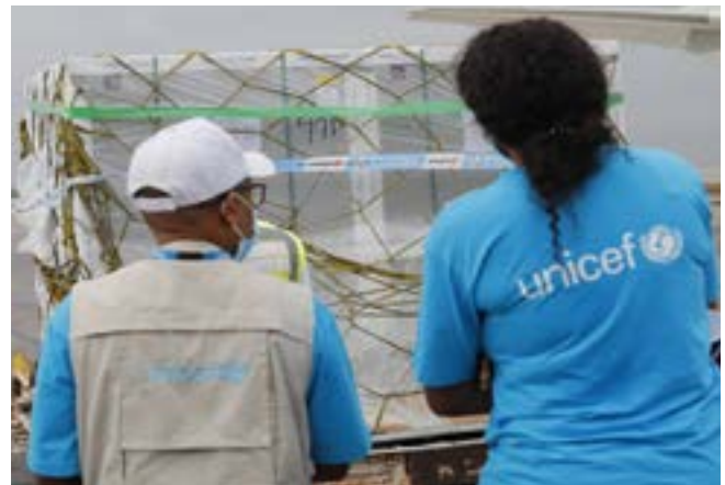
UNICEF staff ready to check the consignment of vaccines at the airport.