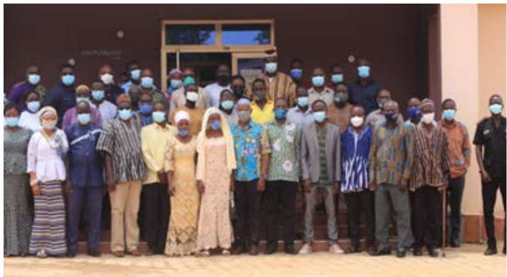
Participants at the peacebuilding, early warning and response training engagement.

In the Sissala East Council. [Read more.] In the Sissala East Council, a peacebuilding, early warning and response training engagement with communities and youth groups has taken place. This was organised in partnership with the Upper West Regional Peace