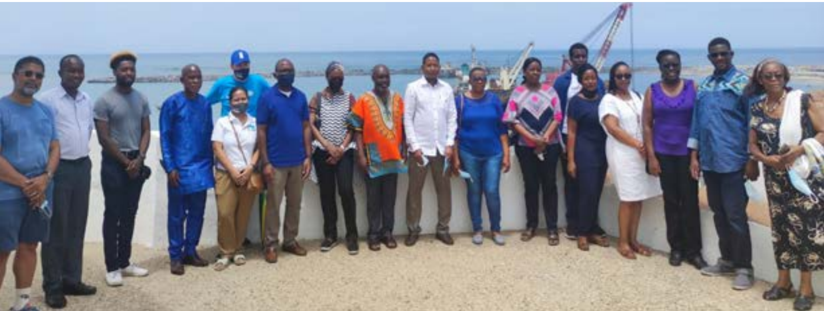
The UNCT members who visited the Fort in a group picture

and stressed the need for solidarity and shared responsibility among the countries in safeguarding outstanding properties such as Ussher Fort, one of 28 components of the UNESCO World Heritage Site Forts and Castles, Volta, Greater Accra, Central and Western regions.