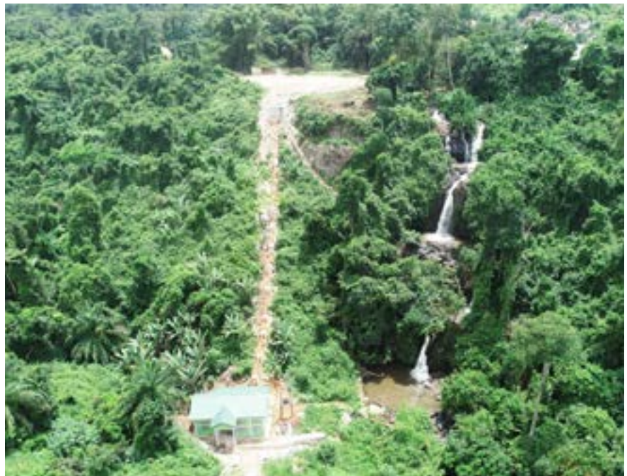
An aerial view of the Tsatsadu Mini-hydro Power Plant.

The Plant, situated at the Tsatsadu Waterfalls, has a power producing capacity of 45kilowatts with the possibility of adding another 40-60kilowatts capacity turbine in the future. [Read more.]