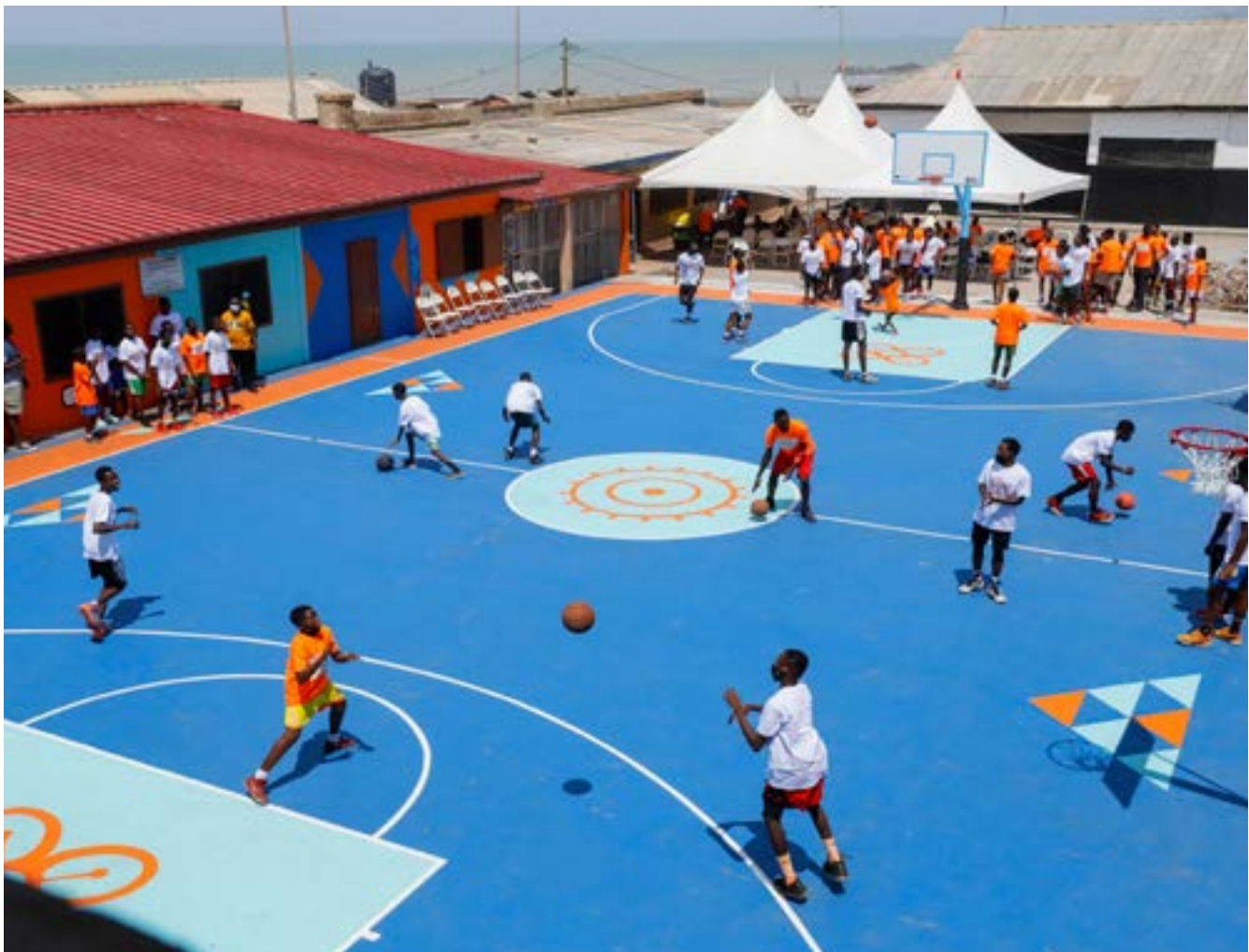
The newly renovated basketball court.