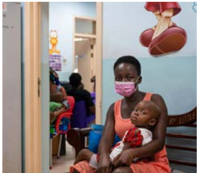
A patient with her mother.