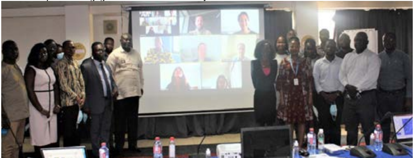
Group photo of in country training participants and virtual resource persons

The key objective of the training was to enable the participants to utilise the Tools, to further build on the current work, and to mainstream resilience in future infrastructure developments.