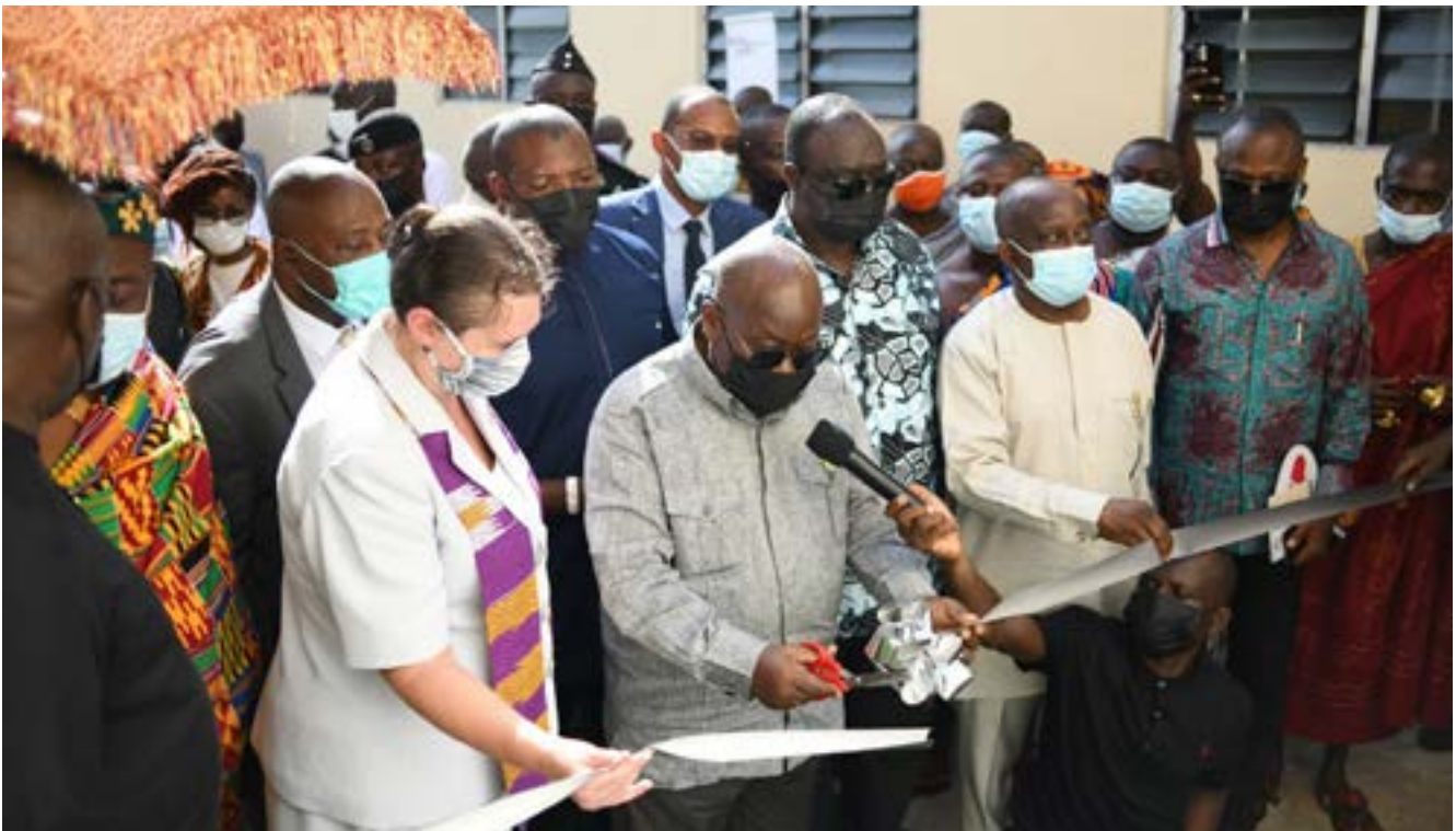
President Akufo-Addo, supported by HE Ms Kati Csaba, the Canadian High Commissioner, cutting the ribbon to commission new Premium Foods factory [above]; Aerial view of the new state-of-the-art Premium Foods factory [Below].

Its extrusion plant produces a ready-to-eat fortified blend of corn and soybeans, fortified with 18 vitamins and minerals, to improve the nutrition of pregnant and nursing women, adults and growing infants. [Read more.]