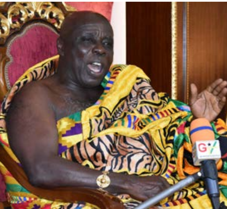
His Majesty, Osagyefuo Amoatia Ofori Panin II, Okyenhene