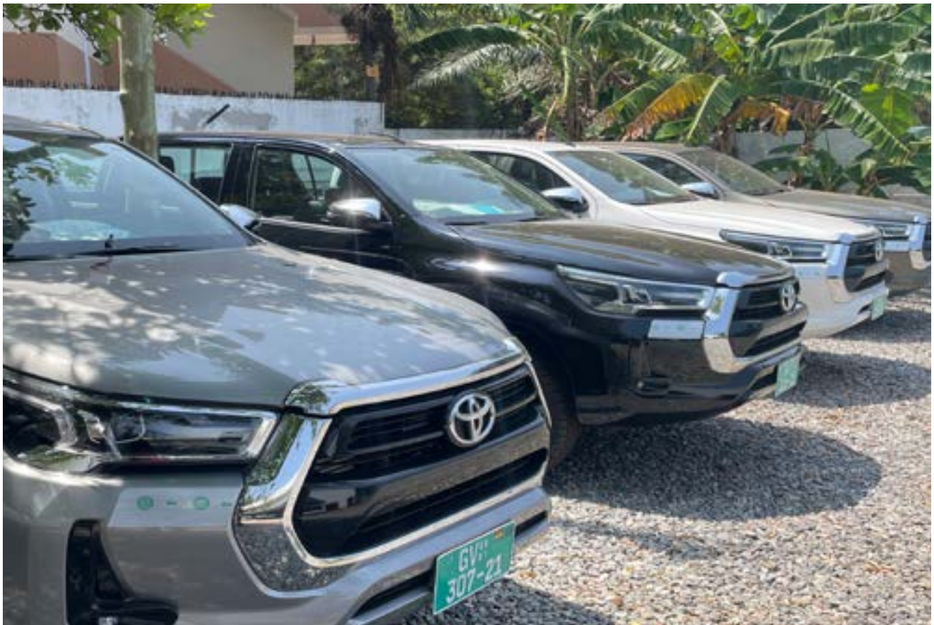
Procured vehicles handed over to Ghana Highway Authority

The Eastern Corridor Road in Ghana project is set to link the capital, Accra, with the northern hinterland and across the borders to the Sahel region. Upon completion, the project would address the needs of an estimated 230,000 people and impact the lives of over 5.4 million inhabitants by reducing travel and transit time, support education and health services delivery while agricultural potentials of the rural areas would be transformed.