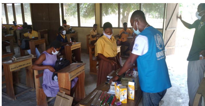
JHS BECE candidates receiving stationary support from UNHCR staff

up at the registration sites without mask. A total of 4,150 out-of-school adolescent girls have been registered so far in the WFP SCOPE system, pending printing of Electronic Voucher (E-Voucher) cards. Meanwhile pregnant and lactating women (PLW) and caregivers of children 6-23 months who are already on the programme continue to receive the specialised nutritious food (SNF) and positive behaviour change communication. A total of 16,293 PLW and 10,808 children were provided with the SNF within the reporting period and at least 27,101 pregnant women and caregivers reached with key SBCC messages including the COVID-19 safety protocols. These are aimed at preventing the aggravation of malnutrition (stunting) situation in the high prevalent/burden areas while ensuring optimum nutrition and good health.