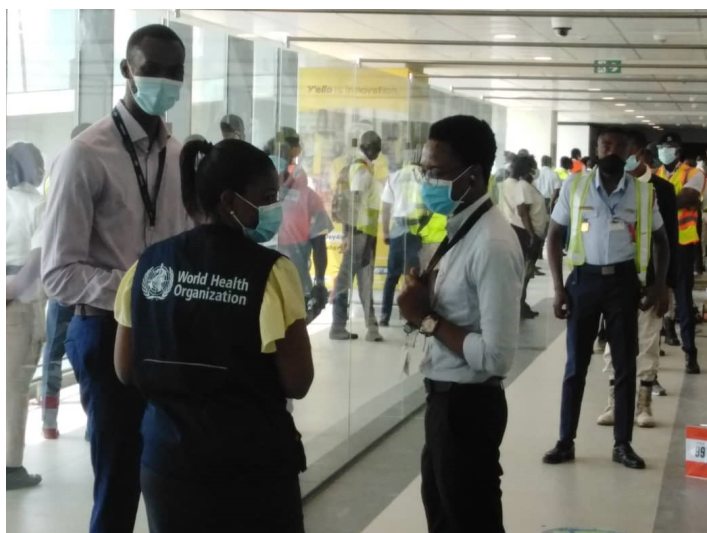
WHO providing technical assistance to simulation exercise at KIA

The Regional Health Directorate of Ashanti region was also supported by WHO to provide cross-cutting training on COVID-19 surveillance, case management and infection and prevention control for rapid response team members from various institutions in 43 Municipal/District Health Directorates in the region. Through that, a total of 397 Doctors, Metropolitan/Municipal/District Directors of Health Services, Pharmacists, Physician Assistants, Laboratory Scientists, Nurses and Midwives, Disease Control Officers, Environmental Health Officers, Health Promotion Officers and Nutrition Officers were trained. Skills and knowledge gained by the health staff would equip them to apply standards for timely response to COVID-19 outbreaks, surveillance, and infection prevention and control to