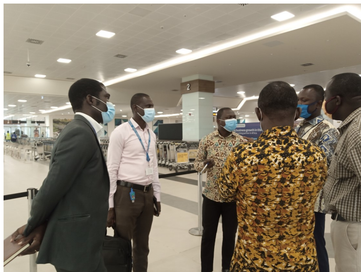
WHO team discussing observations of the simulation exercise with colleagues from GHS, Port health and Laboratory

Understanding the level of adherence to safety protocols such as wearing of face mask could help strategies aimed at containing the spread of the virus in the Greater Accra region