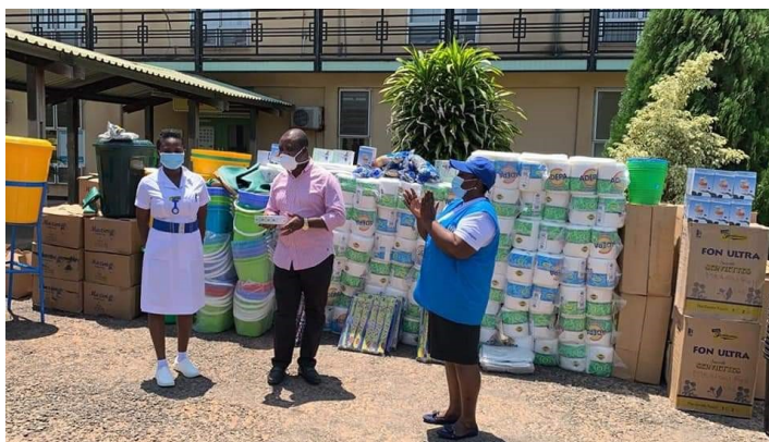
UNHCR handing over PPEs and hygiene products to be provided to health facilities in Regions and Districts hosting refugees

The UNHCR continues to donate PPEs and hygiene products to help support the Government's COVID-19 infection prevention and response efforts. To help national health systems maintain their robustness during and beyond the Covid-19 pandemic, UNHCR has supported health facilities in Regions and Districts hosting refugees with PPEs and hygiene products such as surgical masks, sanitizers, disinfectants, thermometer guns, disposable towels, and bedsheets among others. The latest donation was to eight facilities in the Volta Region. Items worth $320,000 dollars have been donated so far in 5 regions including the Central, Western, Bono, and Volta Regions, as well as