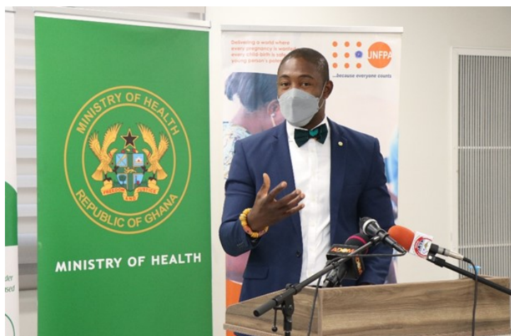
The Deputy Minister of Health at the commemoration of International Day of the midwife, organised by the Ministry of Health in collaboration with UNFPA

UNFPA used the occasion of International day of the Midwife to highlight, on local media, the role of midwives amidst COVID-19 and promote measures to safeguard the lives of both midwives and expectant mothers in the course of childbirth during the pandemic. The commemoration also featured a training for 3500 midwives, from across the country, and other stakeholder on how to protect themselves against COVID-19.