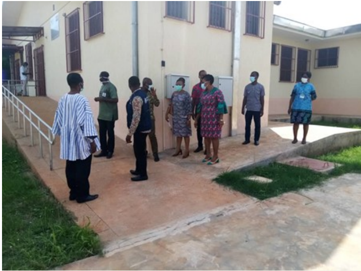
Team inspects the new TB facility to be used as COVID-19 treatment centre, Kintampo, Bono East Region

UNESCO and the Ministry of Education have jointly designed a project to equip, in the future, Junior High School and Senior High School teachers with pedagogical skills in ICT. This will enable teachers to effectively facilitate teaching and learning using ICT tools and online resources.