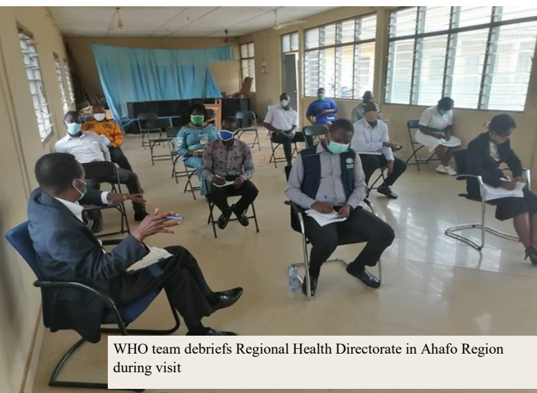
WHO team debriefs Regional Health Directorate in Ahafo Region during visit

WHO continues to make technical input into the daily situational report on the COVID-19 situation and response activities