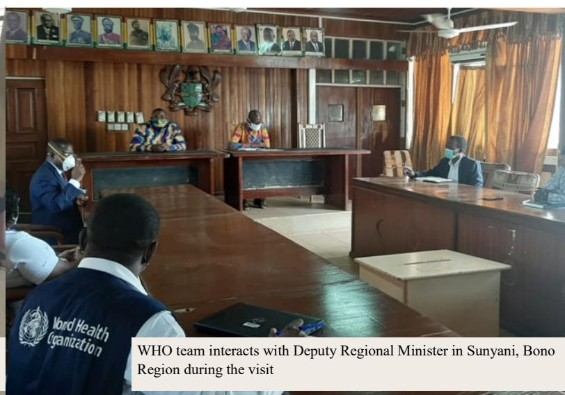
WHO team interacts with Deputy Regional Minister in Sunyani, Bono Region during the visit