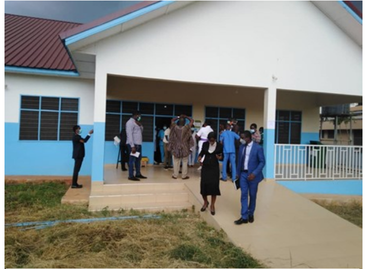
COVID-19 isolation and treatment facility at Goaso Municipal Hospital, Ahafo Region