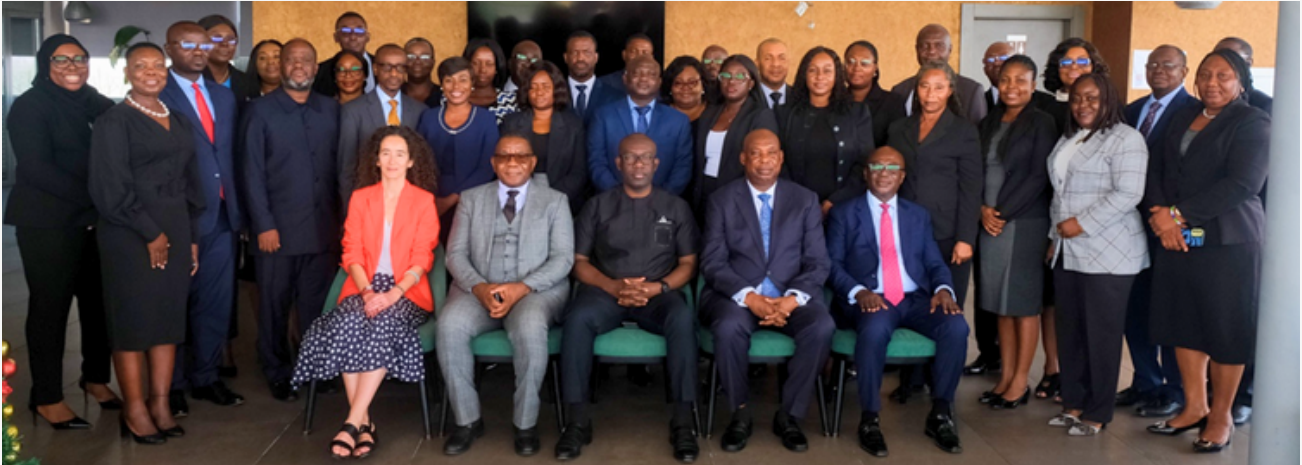
Group photo of 30 judges and dignitaries.

30 Judges were trained on Freedom of Expression, Artificial Intelligence, and Rule of Law in a three-day workshop organized by UNESCO Accra office in December 2023.