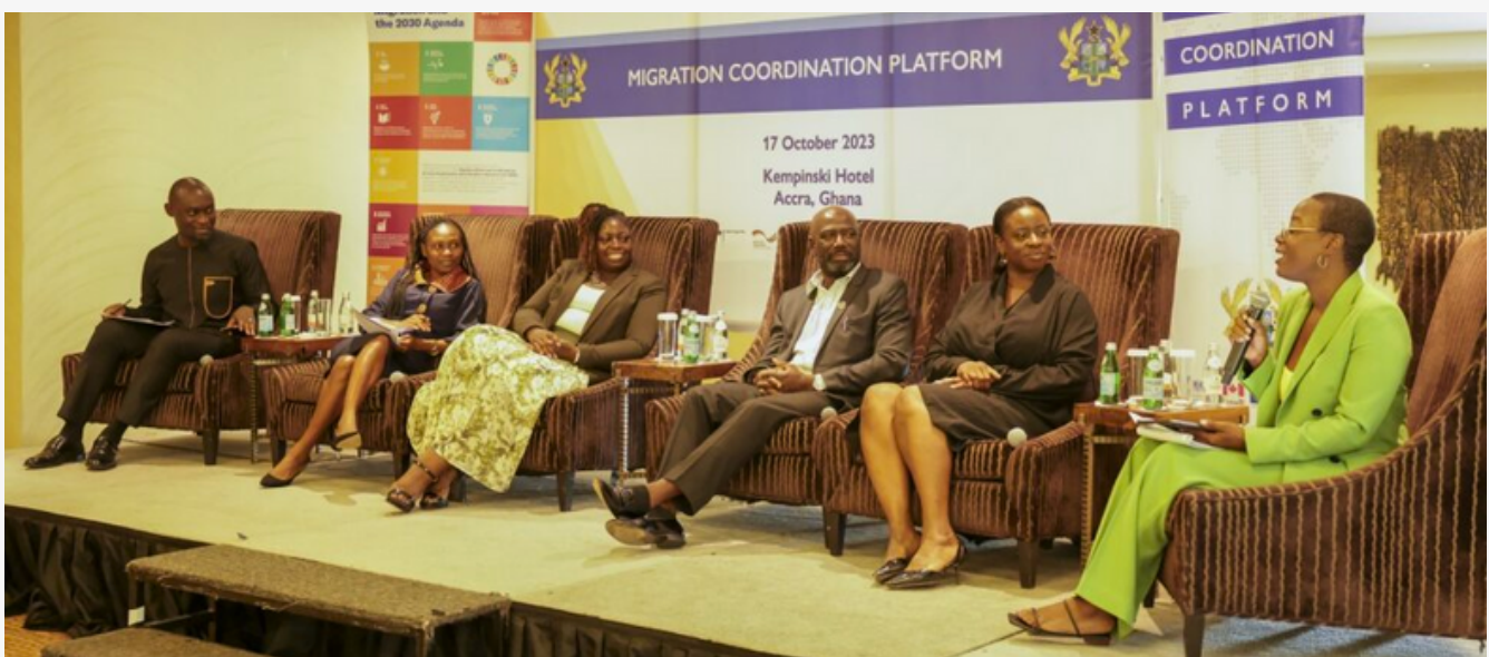
Panel discussion on opportunities for diaspora financing moderated by IFAD.

The discussions were timely considering the launch of the Diaspora Engagement Policy (DEP) in December 2023. Read ahead.