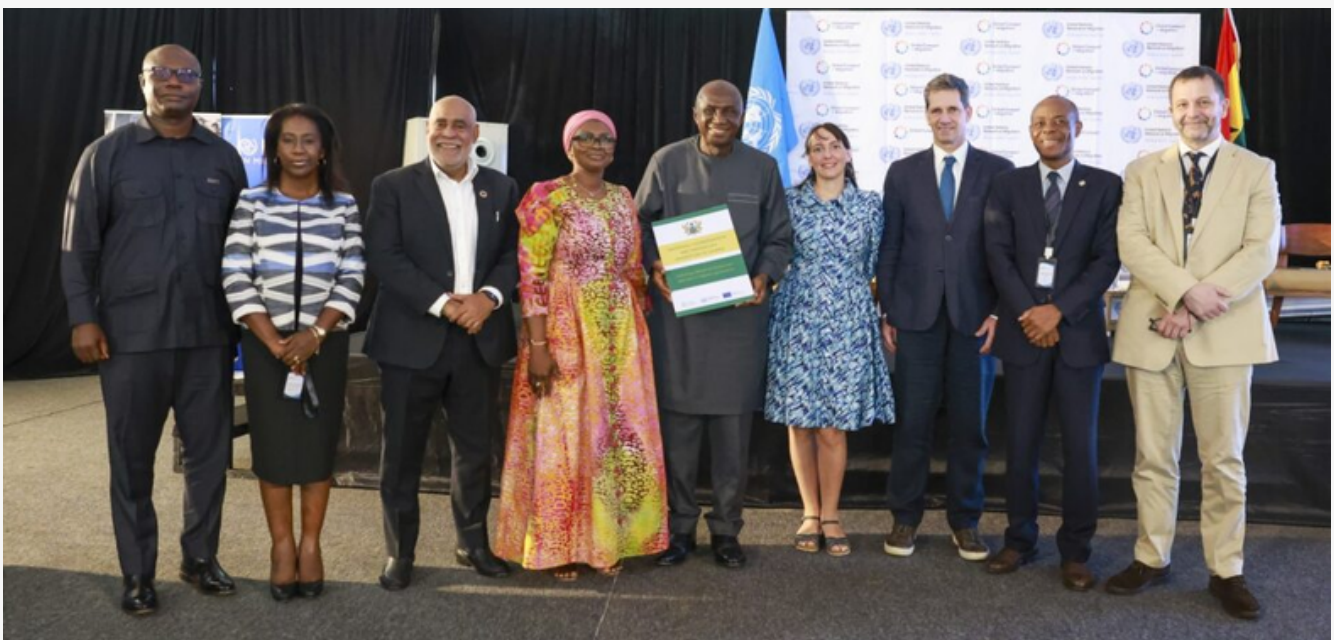
Government of Ghana representatives together with the UN Network on Migration, and European Union launching the National Coordination Mechanism on Migration.

Recognizing the importance of migration for Ghana’s development, the government has recorded considerable progress in making migration more orderly and regular. The NCM is the latest step in this endeavor and will be instrumental in creating meaningful engagement and cooperation on migration by avoiding duplication of efforts. Read more.