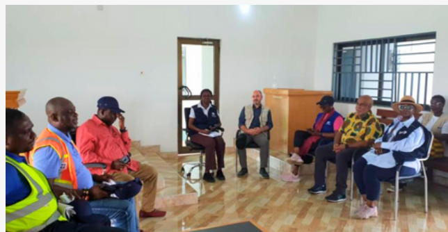
UN delegation being briefed by the NADMO officials.

IOM also teamed up with Ghana Psychological Association to provide psychosocial assistance to affected people. Following a capacity building session focused on psychosocial assistance in the context of emergencies, the team visited the safe havens in Central Tongu and North Tongu and supported 200+ people with their mental health needs, including a donation of medication to the Ghana Health Services.