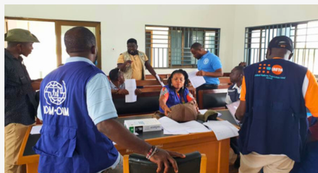
Rapid Assessment Team of the Inter-Agency Working Group on Emergencies in a working session at Battor prior to their field work.