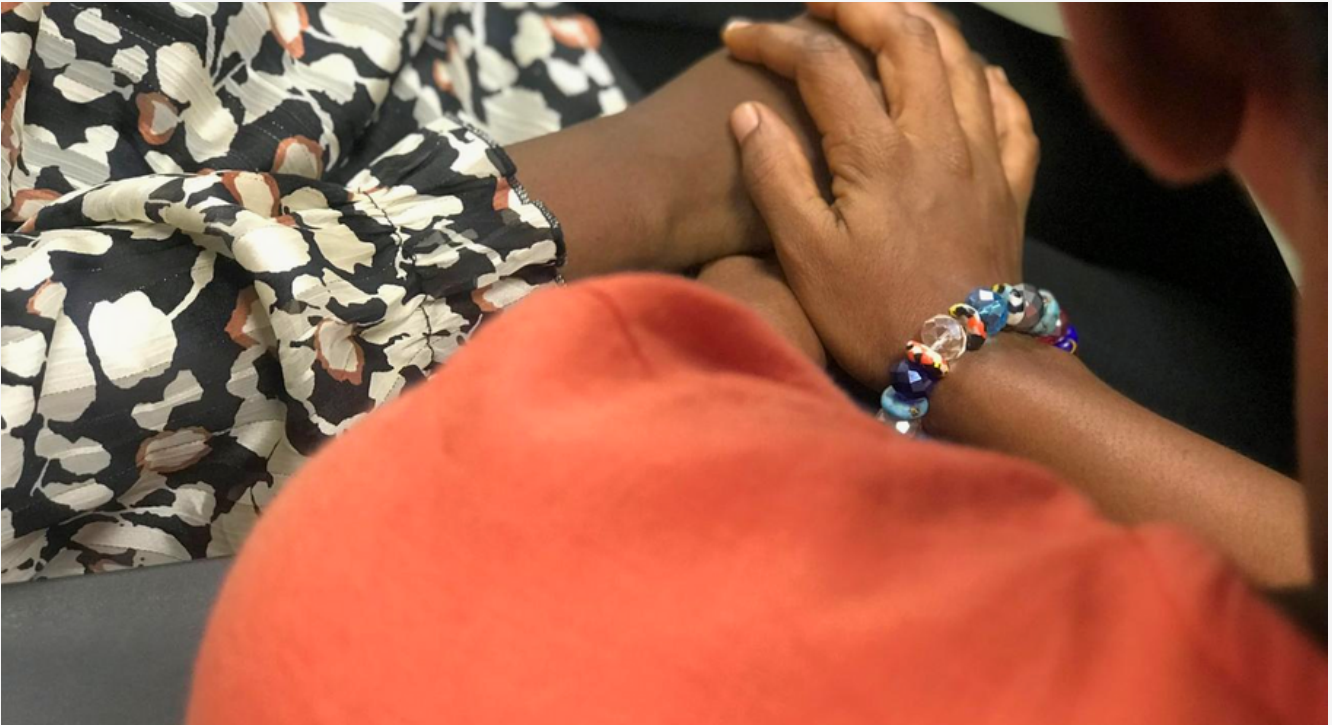
A mother holding her daughter's hands.

The search for hope can be a challenging feat, especially when faced with a life-altering circumstance like being tested HIV positive during a routine antenatal check-up. For many expectant mothers in such a situation, the overwhelming fear of transmitting the virus to their unborn child can be paralyzing.