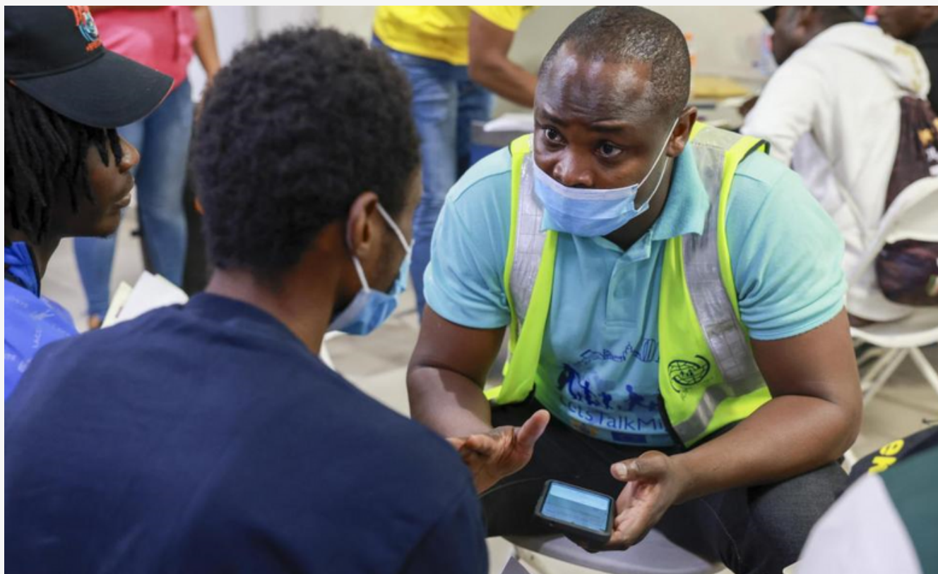
IOM Ghana staff at Kotoko International Airport welcoming returnees.

The International Organization for Migration (IOM), in close collaboration with the Government of Ghana, facilitated the voluntary return of over 300 Ghanaian migrants from Libya via charter flight on two occasions in October 2023.