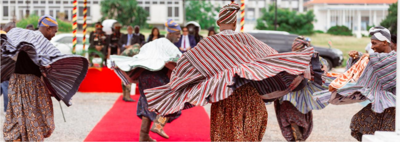
Traditional dancers perform at the UN Day event.

Inch by inch, the flags of the United Nations and Ghana, in synchrony, were raised at the sound of both anthems during a flag-raising ceremony held in Accra to commemorate the 78th anniversary of the UN.