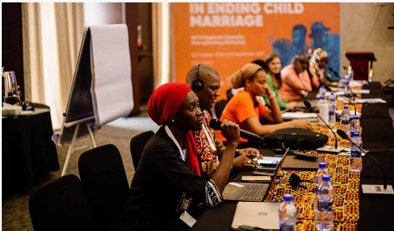
A section of youth participants during discussion..

Child marriage violates the rights of girls and is a stumbling block to their dignity. Girls forced into early marriages suffer complications in pregnancy or during childbirth. UNFPA advocates for an end to child marriage to protect the lives of women and girls.