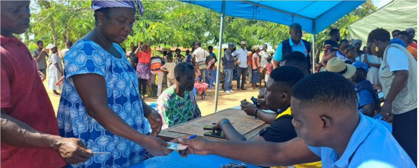
A resident receiving her cash support