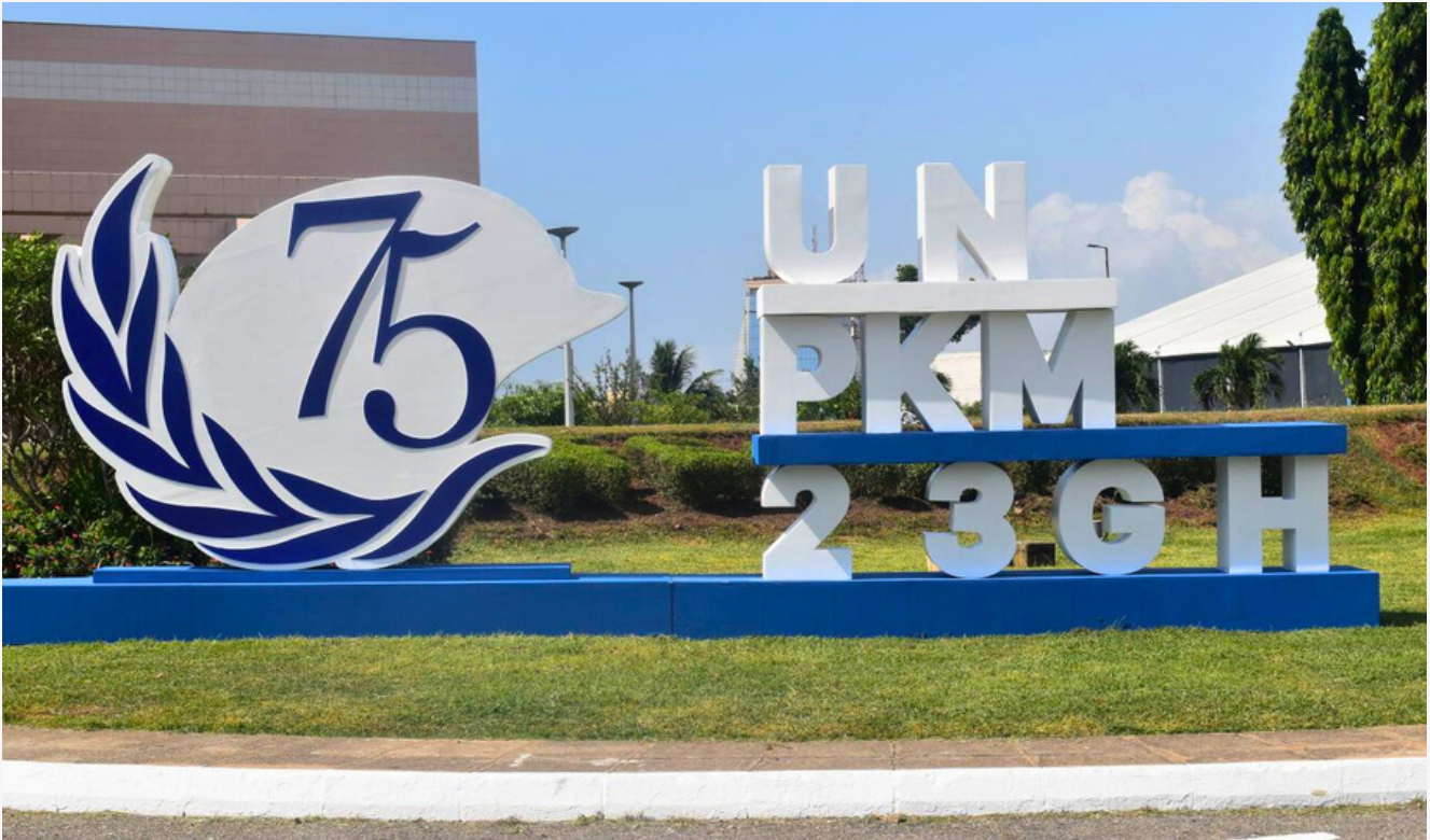
Signage at the entrance of the Accra International Conference Centre, venue of the 2023 Peacekeeping Ministerial.

The Vice President of the Republic of Ghana, H.E. Dr. Mahamudu Bawumia has underscored the significance of international cooperation and partnership in maintaining peace and stability, highlighting the role of United Nations peacekeeping as a key player in these efforts.