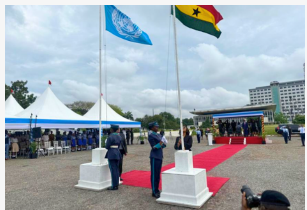
The UN flag and the Ghana flag hoisted.