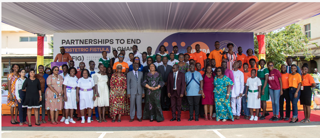
A group photo of partners with the First Lady of the Republic of Ghana at the launch of the Partnership to End Fistula in Ghana (PEFIG).

The United Nations Population Fund (UNFPA) in Ghana has formed a partnership with the First Lady of Ghana, Mrs. Rebecca Akufo-Addo through the Rebecca Foundation, together with other stakeholders towards the elimination of obstetric fistula among women in the country.