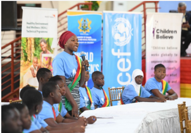
Young parliamentarian addressing the house with issues from her constituency.

UNICEF joined the Ministry of Gender, Children and Social Protection to celebrate this year's World Children's Day in the Northern region.