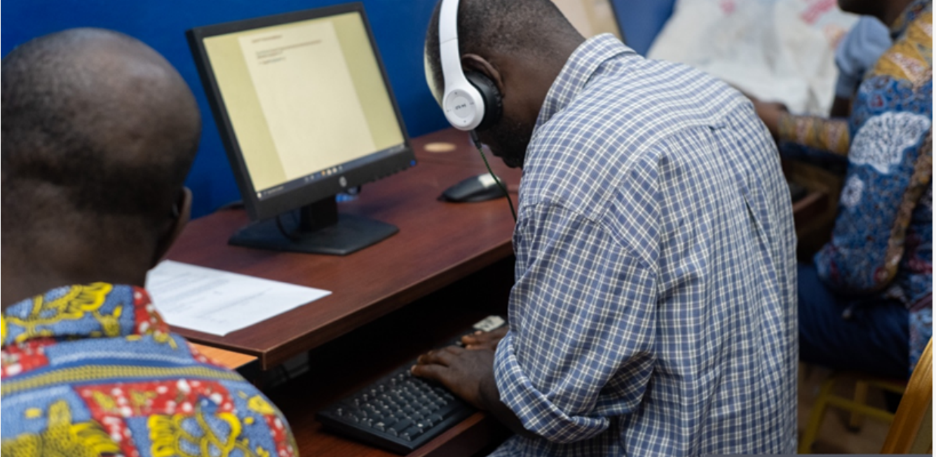
Visually impaired teacher navigating the computer.

In a bid to promote inclusive and innovative education under the Technology-enabled Open Schools for All" project, a transformative workshop was organised at the Akropong School for the Blind to advance digital proficiency among teachers.