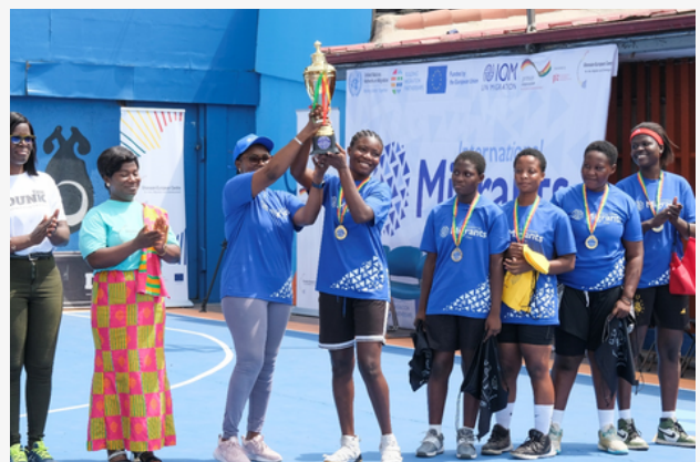
Winners of the basketball competition during Migrants Day celebration in Jamestown, Accra

Every year on 18 December, the International Organizations for Migration (IOM) celebrates International Migrants Day, a moment to reflect on and celebrate the contributions of millions of migrants worldwide.