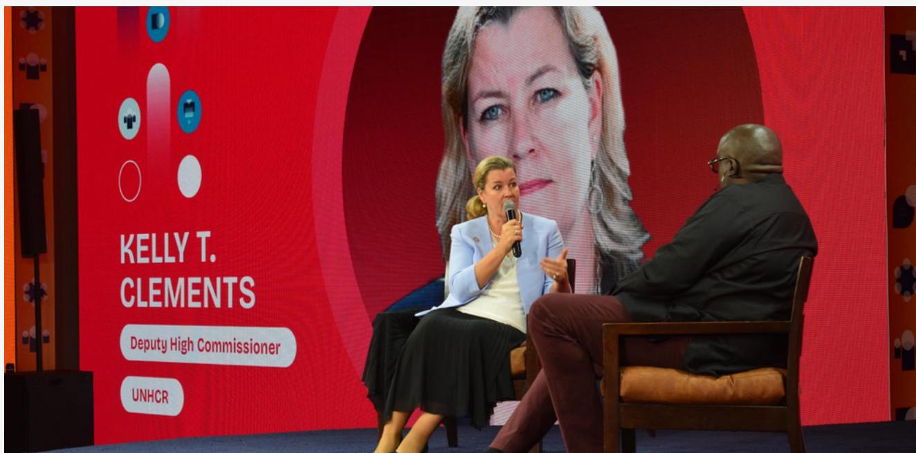
The UNHCR Deputy High Commissioner, Ms. Kelly T Clements during a discussion.

Finding African-led solutions to people forcefully displaced is paramount.