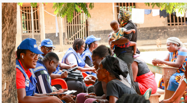
Registration of displaced people.