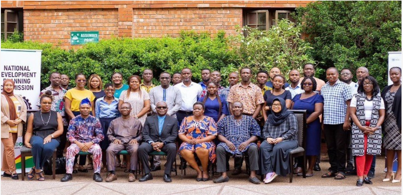
Group picture of participants of the training session.

Technical experts in programme, planning, monitoring and evaluation, and research and innovation, from key ministries, departments, and agencies (MDAs) in Ghana concluded a three-day training on using Economic Commission for Africa’s Integrated Planning and Reporting Toolkit (IPRT).