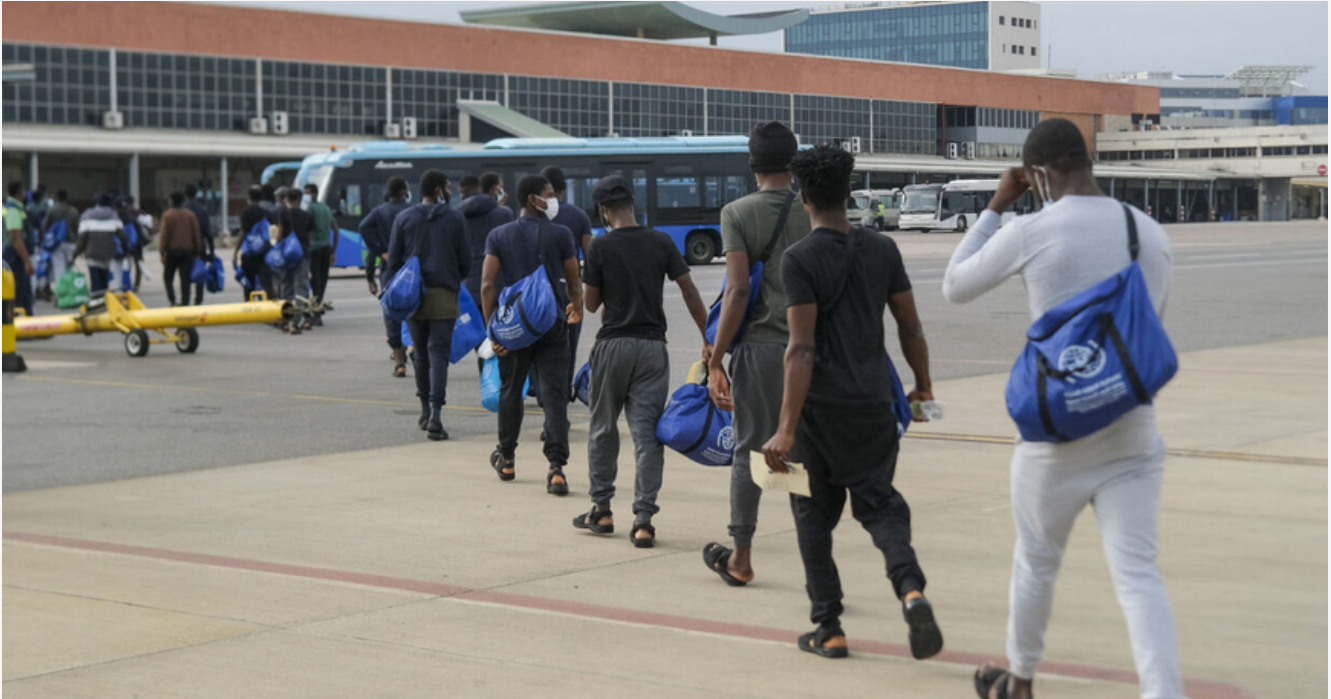
Ghanaian migrants arriving at the airport in Accra.

On 24 August, IOM Ghana, with funding from the European Union and in collaboration with key Government of Ghana agencies, welcomed 162 Ghanaian migrants who voluntarily returned from Libya via charter flight.