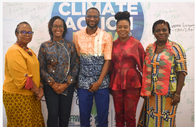
Group photo of UN staff at the AFRIWOCC event.

Again, the UN provided valuable insights into the event planning and organization and facilitated space for investment in disability inclusion by the private sector.