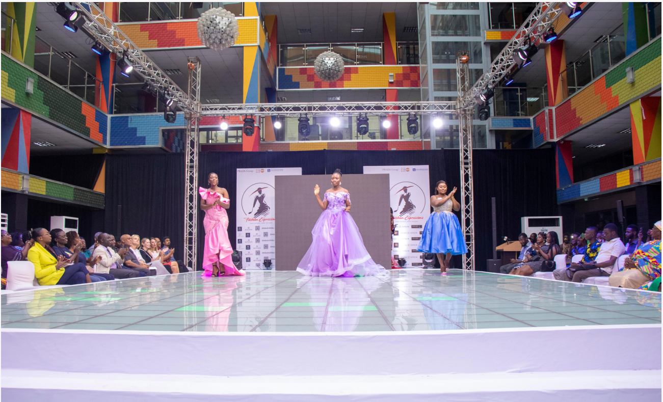
Some models cat walking in the designed clothes by trainees of the Fashion Expressions Programme.

After months of training and industrial attachment with leading Ghanaian fashion brands, participants of the UNFPA, PRADA and International Needs Ghana skills training initiative have taken part in a fashion show to showcase their creativity and ingenuity.