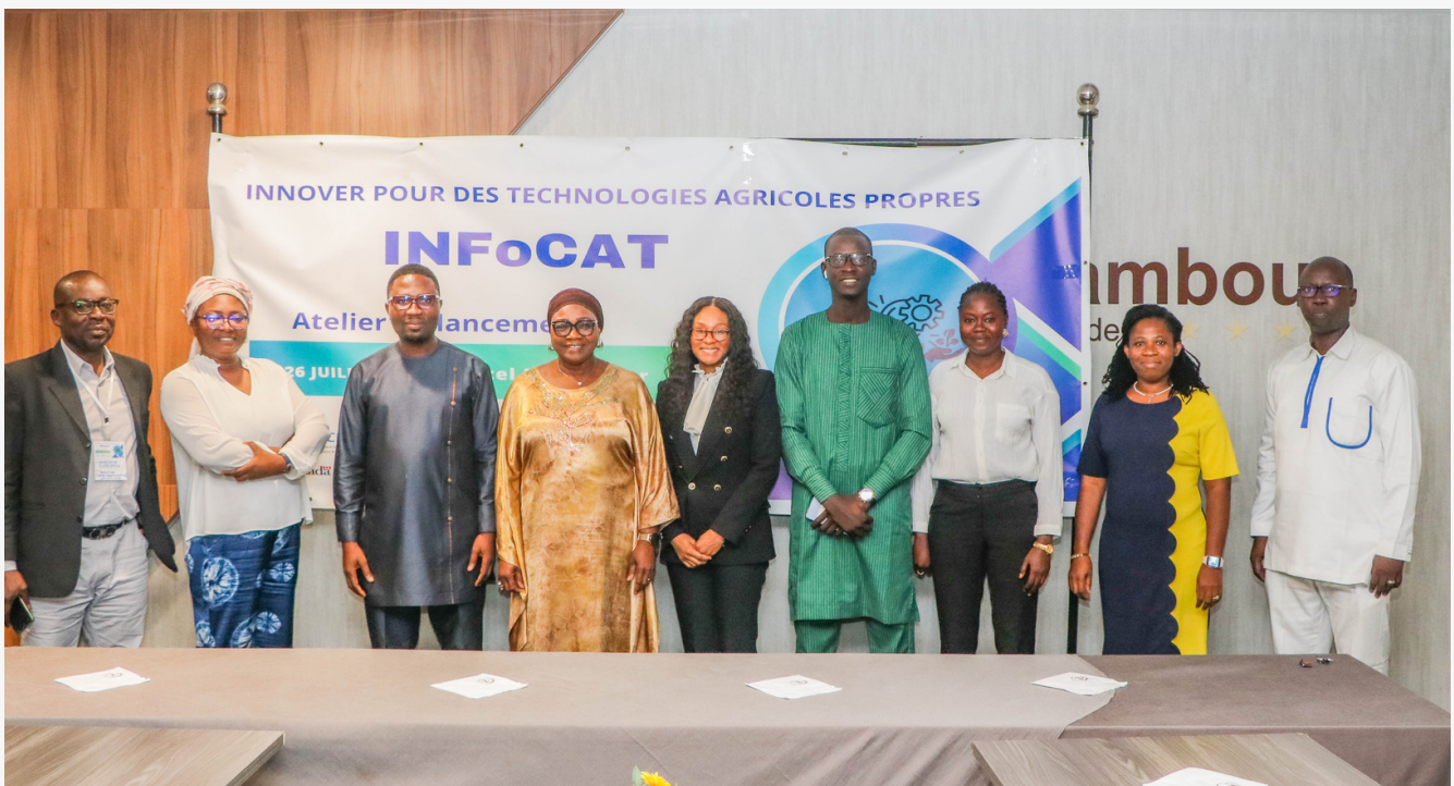
INFOCAT Inception Workshop INRA team with stakeholders.

Funded by the IDRC, INFOCAT seeks to advance women's and youth economic empowerment in rural areas of selected African countries (Ghana, Senegal and Cote D'Ivoire), by promoting low-cost clean energy-powered technology solutions that increase agricultural productivity and income for smallholder rural farmers. ENDA Energie of Senegal is also a key partner.