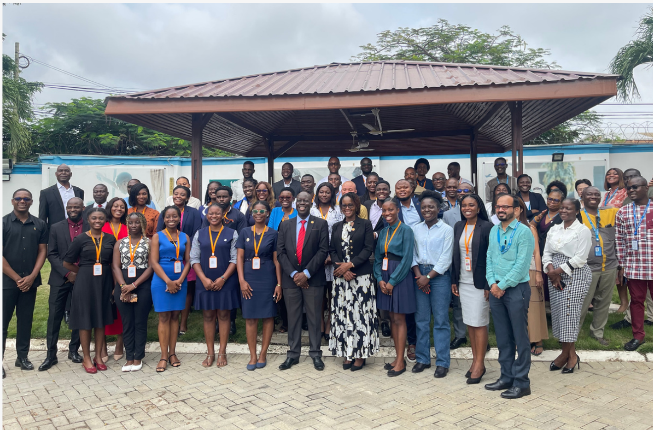
The 5th Cohort of YoLe Fellows in a group photograph with staff and personnel of the UNFPA Ghana Country Office.

Inaugurated in 2018 in line with the UN Secretary-General's Strategy on Youth, the Youth Leaders (YoLe) Fellowship Program has entered into its 5th chapter with the start of a new Cohort.