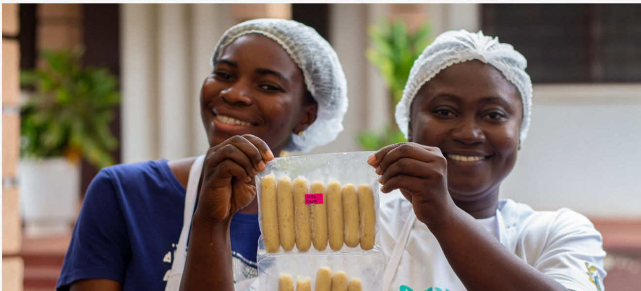
School meal cooks hold up an example of a fish product to be integrated into school meals.

The Food and Agriculture Organization of the United Nations (FAO) and the Government of Ghana have forged a strategic partnership to bolster child nutrition and support the livelihoods of small-scale fishers. In July 2023, both institutions unveiled a policy on integrating fish into school meal programs.