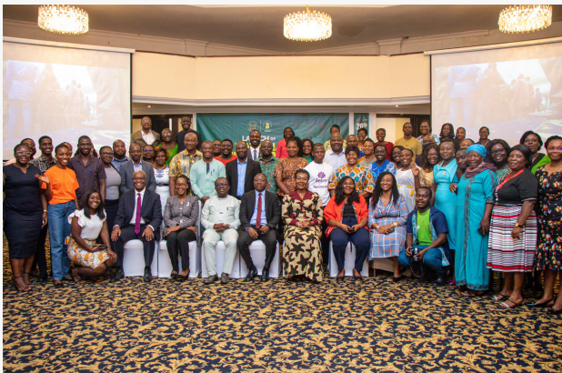
Group photograph of partners and stakeholders at the launch of the 2023 National Family Planning Week.

Identifying more options to increase domestic financing for family planning is critical to increase reach and ensure the sustenance of family planning interventions in the country.