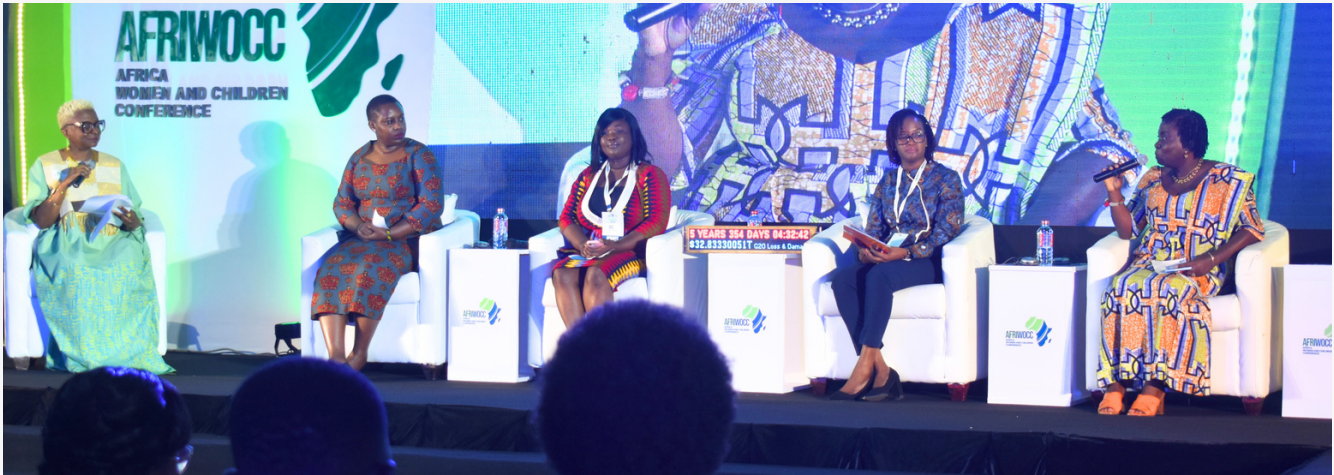
Panel discussion during AFRIWOCC.

The United Nations in Ghana continues to influence critical thinking and policy decisions in areas that are vital to nation building and development in alignments with its current Cooperation Framework. By exploring unique engagement opportunities and collaborating with key partners, both new and old, the UN is leveraging its collective thought leadership to stimulate discussions around some critical areas, including climate action, resource mobilization, innovative financing solutions for Small and Medium-Scale Enterprises, digitalization and human rights.