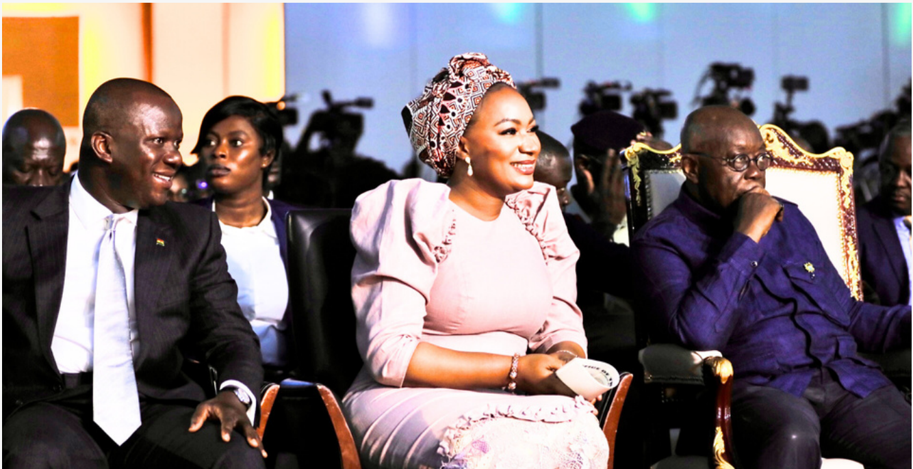
H.E Nana Addo Dankwa Akufo-Addo (left) and the 2nd Lady, H.E Samira Bawumia.

Subsequent to the conference, UNICEF hosted an X-Space on climate change and youth, featuring U-Reporters. The views expressed would certainly go a long way to influence policy decisions and solutions to climate change on young people.