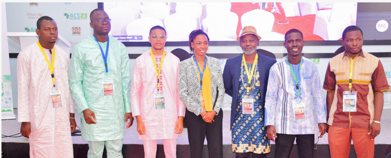
ACW (some attendees of INRA side event from WASCAL)

Africa is responsible for only a fraction of global greenhouse gas emissions but is suffering disproportionately from climate change, according to the State of the Climate in Africa 2022 regional report released by the World Meteorological Organization (WMO).