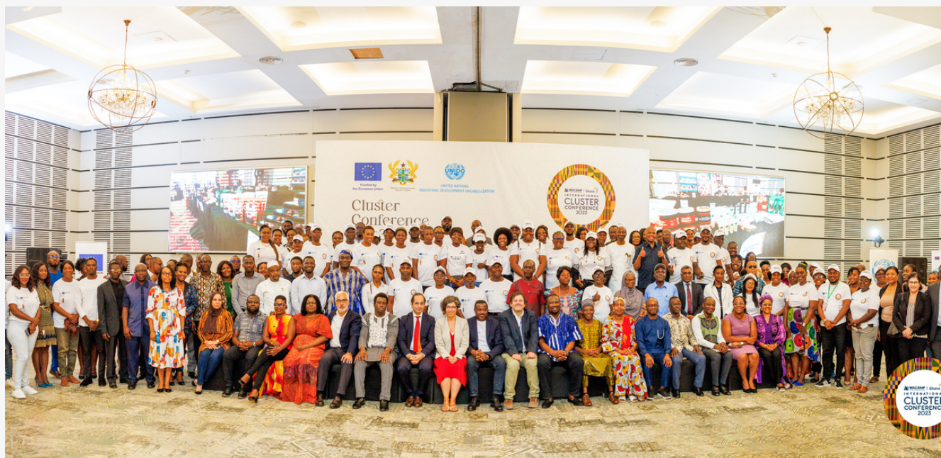
Group photo of participants at the 2nd Ghana International Cluster Conference held in Accra on the 22nd August 2023.

The second Ghana International Cluster Conference has taken place in Accra. Held in partnership with the European Union (EU) and the Ministry of Trade and Industry (MoTI), the conference registered over 200 participants from the African Union Commission, ECOWAS Commission, Federation of the West African Chambers of Commerce and Industry (FEWACCI), representatives of AUDA/NEPAD, Business Councils and cluster practitioners from Ghana, Liberia, South Africa, Nigeria, Uganda and Morocco.