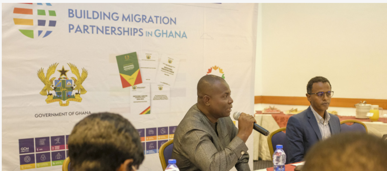
Meeting to validate the Terms of Reference for a new national coordination mechanism on migration on 5 September in Accra.

This collaborative effort between the UNNM in Ghana and migration stakeholders paves the way for improved migration governance in Ghana.