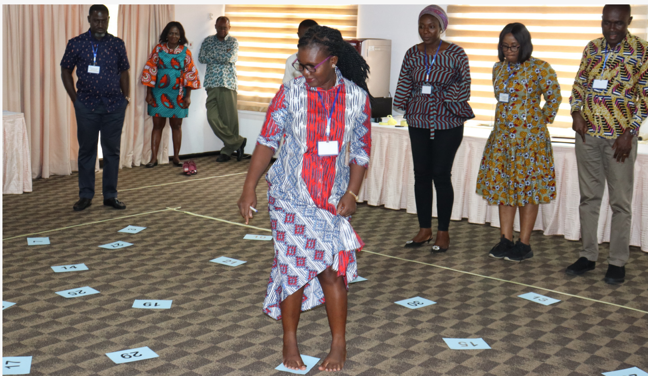
Health sector leaders undergoing 360 leadership training per the WHO leadership programme.

Achieving Universal Health Coverage (UHC), where all people have access to the health services they need, when and where they need them, and without financial hardship, requires a critical look at health sector reforms.