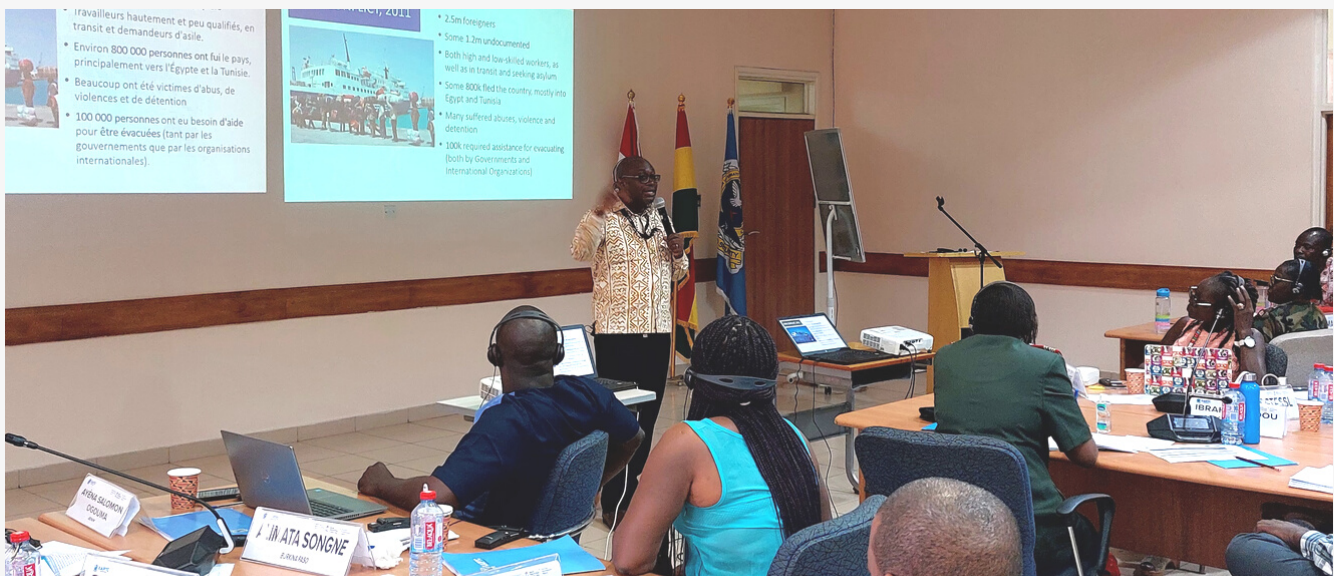
IOM staff leads session at KAIPTC

In February, IOM Ghana delivered several sessions of courses on Migration Management and Humanitarian Assistance in West Africa at the Kofi Annan International Peacekeeping Training Centre (KAIPTC) in Accra.