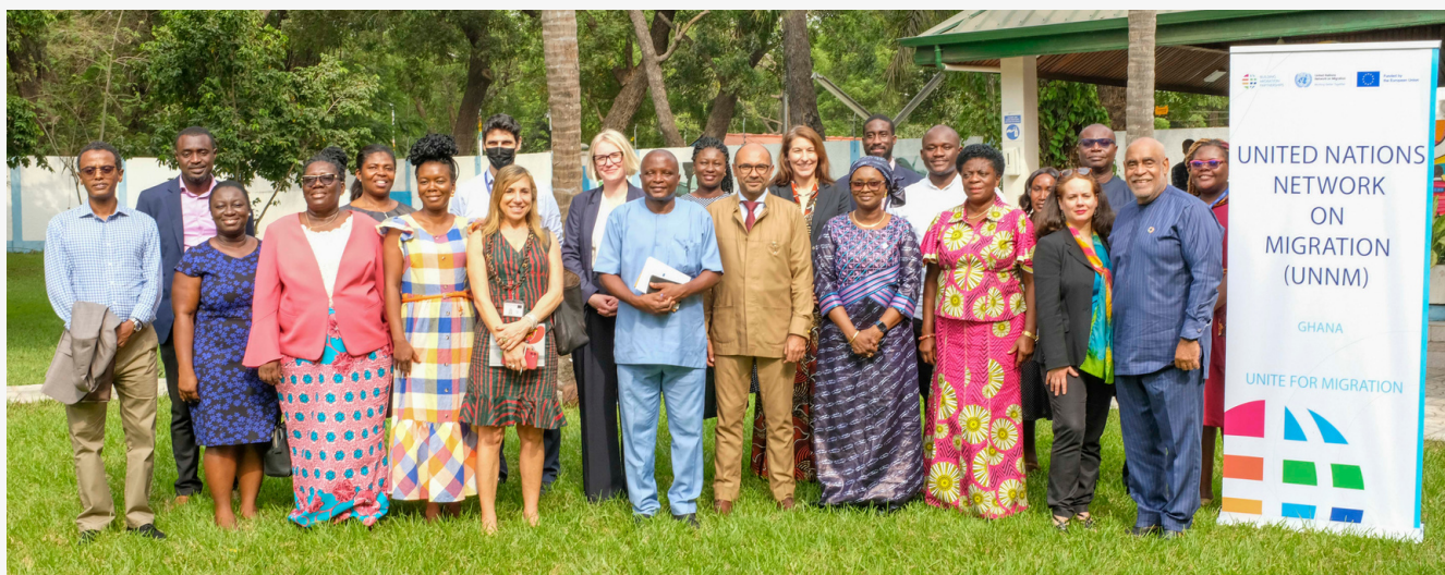
Participants of the project launch

On 22 February 2023, the Government of Ghana, the United Nations Network on Migration (Network) and the European Union (EU) launched the flagship project Building Migration Partnerships in Ghana.