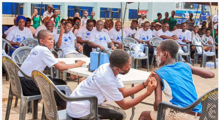
Engaging the community in Aflao on public health emergencies @ IOM/CARD Ghana

The provision of ambulances, construction of Water, Sanitation and Hygiene (WASH) facilities and installation of prefabricated isolation centres are complementary interventions implemented by IOM in the three border communities. Read ahead.