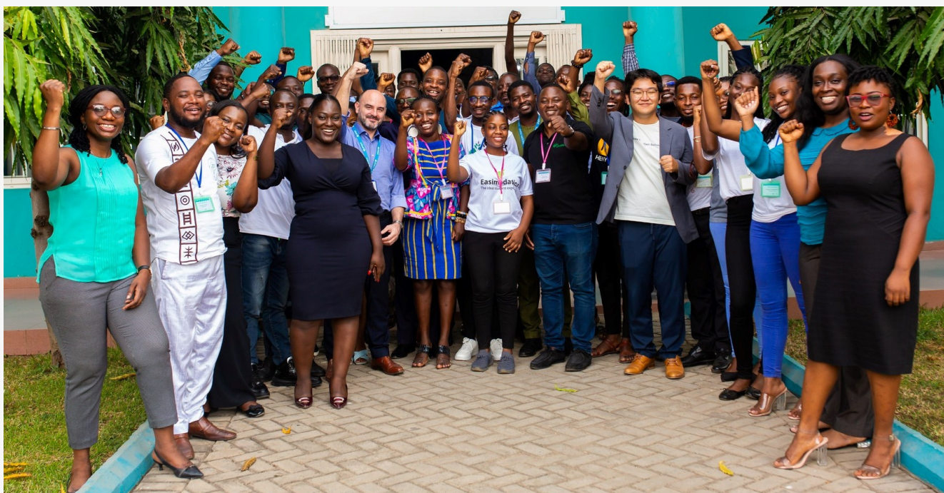
UNICEF StartUp Lab

The 3rd Cohort of the UNICEF Startup Lab (USL), designed and led by UNICEF in Ghana was launched on 11 January in Accra. Supported by the Korea International Cooperation Agency (KOICA), the USL is an accelerator program for impactful tech-driven businesses working to advance the Sustainable Development Goals for children and young people. It delivers a six-month curriculum to startups through intensive boot camps in Accra, as well as incubation hosted at partner hubs.