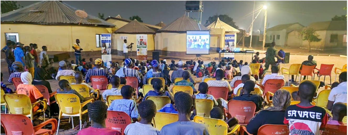
Awareness raising on safe migration in Tamale

IOM Ghana engaged with communities across the country to raise awareness on safe migration as well as on preparedness against public health emergencies.