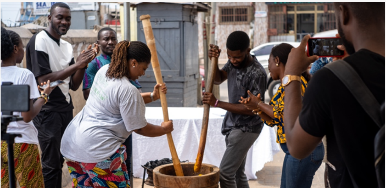
Participants document how to make "Aprapransa" in Jamestown.