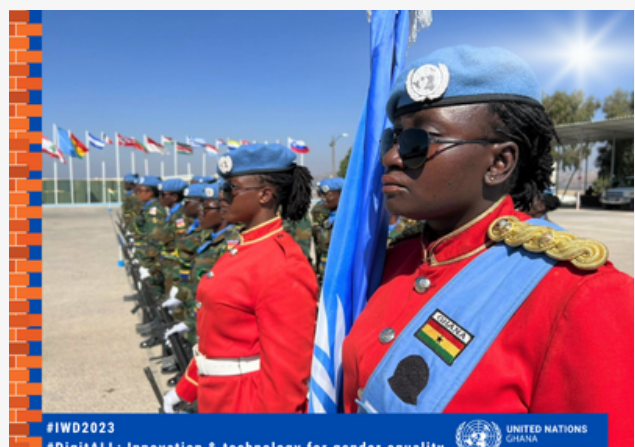
A Ghanaian UN Peacekeeper