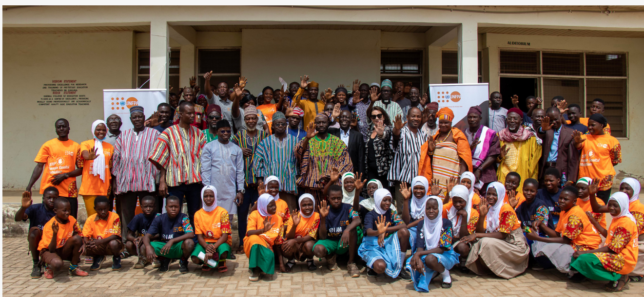
Participants at the observation of the 2023 International Day of Zero Tolerance for FGM.