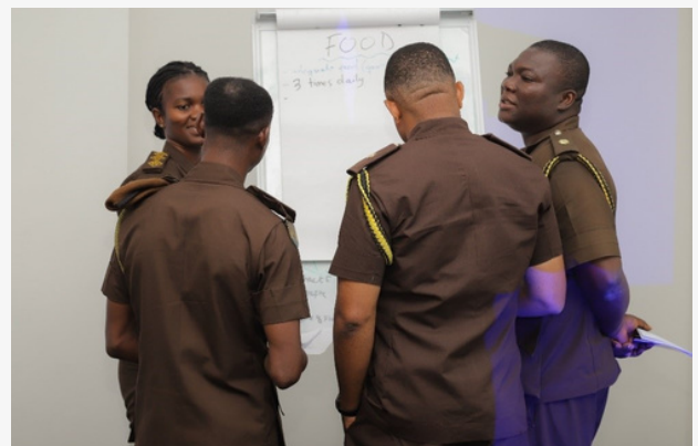
Some prison officers at the recently held workshop on the Nelson Mandela Rules (Above) Handing over of the mattresses to GPS (Below). @UNODC

This workshop is the first of three, with two more to be held in Kumasi and Tamale. These will train over 65 prison officers from all the prisons in Ghana. They are expected to reach a further 1,500 prison officers, effectively embedding the rules where they will make the biggest difference.