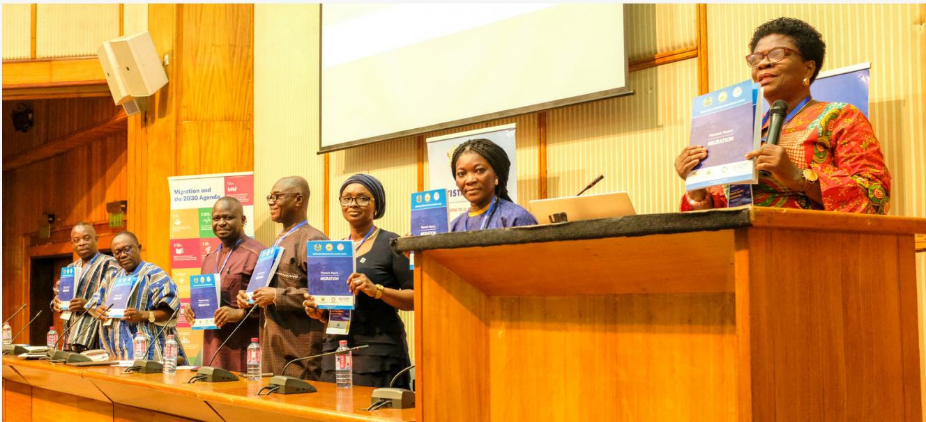
Government launches report on migration of its 2021 Census

On 9 March 2023, at the Accra International Conference Center, the International Organization for Migration (IOM) joined the Ghana Statistical Service (GSS) and the Ministry of the Interior (MINTER) to launch the Thematic Report on Migration of its 2021 Population and Housing Census.