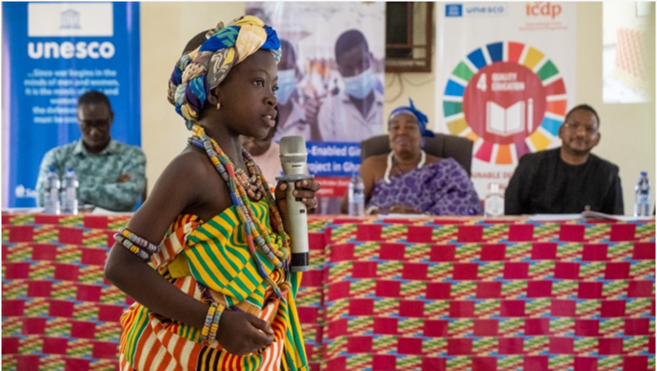
Poetry recital by a basic- 2 learner

In collaboration with Prada, UNESCO Ghana successfully launched the UNESCO-Prada Technology-enabled Girls' Education and Support Project. The project was initiated as part of the Global Education Coalition launched by UNESCO, Google, Huawei, and Prada in March 2020 to support countries in scaling up their best distance learning practices amidst COVID-19 school closures.