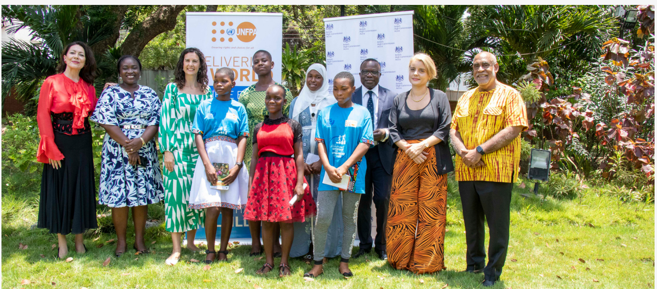
The Ambassadors and mentors in a group photograph with the adolescent girls.