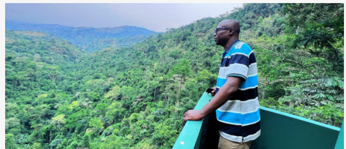
A community member enjoying the view of the restored Weto landscape at Amedzofe in the Volta Region of Ghana.

HOW A COMMUNITY-DRIVEN FOREST RESTORATION PLATFORM HAS LED TO THE CONSERVATION OF 135,500 HECTARES OF FORESTLAND, BOOSTING ECOTOURISM IN GHANA.