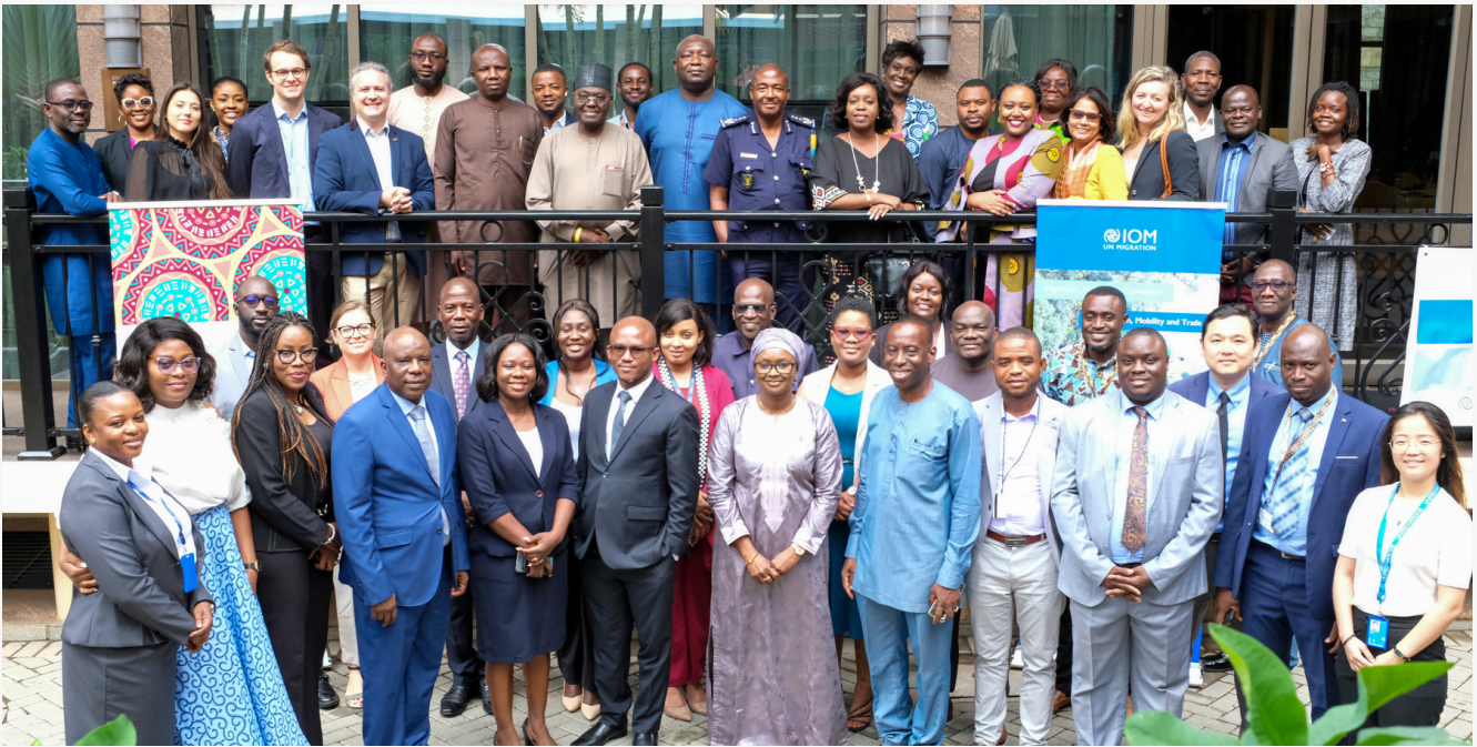
Participants of the regional conference on cross-border trade in Accra

The International Organization for Migration (IOM) in March held a Regional Consultation on “Migration, Mobility and Trade: Capitalizing on small-scale cross-border trade (SSCBT) for sustainable community development in West Africa”. Government officials from Benin, Burkina Faso, Ghana, Guinea, Liberia, Togo, Mali, Mauritania, and Niger, from Ministries and Departments with immigration and trade functions, as well as representatives from the African Union Commission, ECOWAS, the AfCFTA Policy Network (APN) Secretariat and other development partners explored how cross-border trade contributes to community development. A first-of-its-kind, the workshop fostered a better understanding of current and emerging issues around SSCBT through the prism of the African Continental Free Trade Area (AfCFTA).