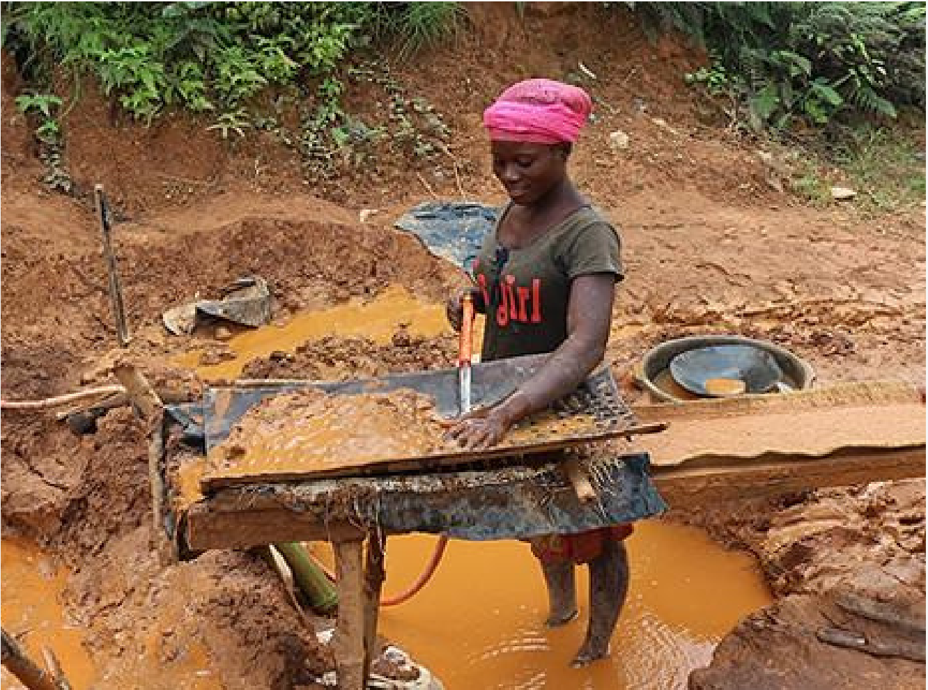
Small scale mining in Ghana

The Environmental Protection Agency in partnership with the United Nations Development Programme (UNDP), the United Nations Industrial Development Organization (UNIDO), the UN Environment and the Conservation International has begun the implementation of a new project called planetGold+. This project which is part of a global initiative and funded by the Global Environment Facility (GEF) is an initiative seeking to make small scale mining safer,