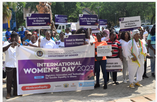
Participants walking through the streets of Accra

In observance of the Day, IOM Ghana donated food items to a Government of Ghana shelter for survivors of trafficking. The items are used to support shelter residents during their stay at the shelter, before their safe return to their communities and countries of origin.