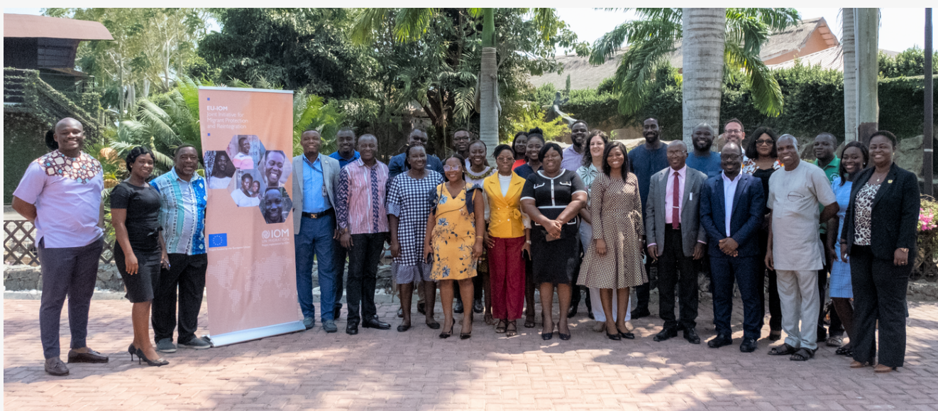
Participants at the Training of Trainers workshop