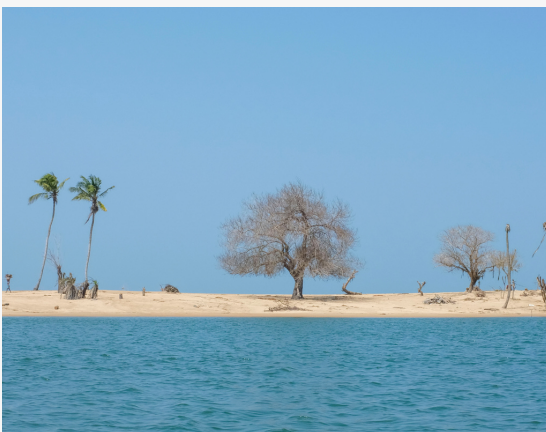
Coastal erosion on the Volta Delta

It aims to enable diaspora members to build connections with key stakeholders in Ghana (as well as in Bangladesh, Jamaica and Albania), that can help them achieve more effective and coordinated climate action, and greater and longer-lasting impacts on climate-vulnerable populations. This initiative is funded by IOM Development Fund. Read ahead