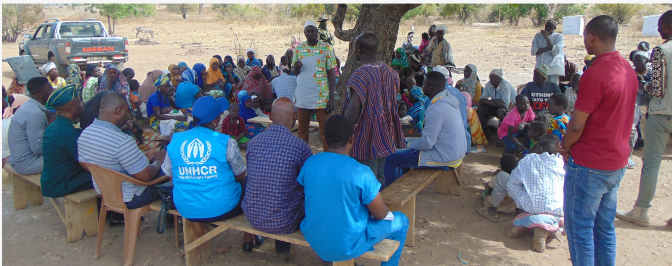
UNHCR Country Representative, Ms. Esther Kiragu interacting with some Burkinabe asylum seekers at Sapeliga in the Bawku East Region

Disturbances in neighbouring Burkina Faso following Jihadists attacks have resulted in the continuous influx of Burkinabe asylum seekers to the Northern parts of Ghana calling for the need for urgent humanitarian assistance to support the new arrivals.