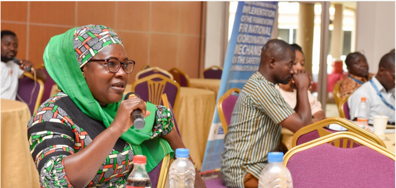
Stakeholders engagement session

The Ghana Independent Broadcasters Association (GIBA) with support from UNESCO Ghana commemorated World Radio Day in Tamale, in the Northern Regional capital on the theme, "Radio and Peace." The day was used to highlight the importance of radio in reporting and informing the general public, shaping public opinion and framing a narrative that can influence domestic and international situations and decision-making processes.