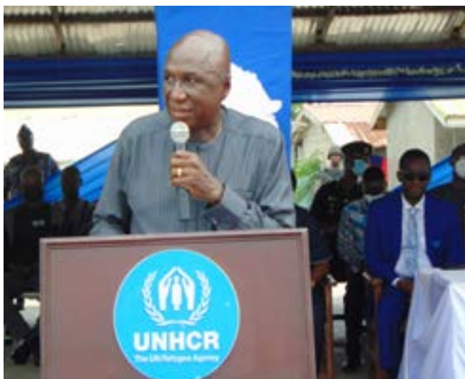
Minister for the Interior, Hon. Ambrose Dery.

He said Ghana has since independence, proven to be a safe place for persons fleeing territories where they fear they will be persecuted. He pledged government will continue to live up to its responsibilities as spelt out in the UN Convention on the Status of Refugees as well as the 1969 AU Convention on Refugees which Ghana is a signatory to. He said Ghana manages what has been referred to as a progressive asylum system that does not require all refugees to stay in camps and provides opportunities for refugees to develop their potential. Read more.