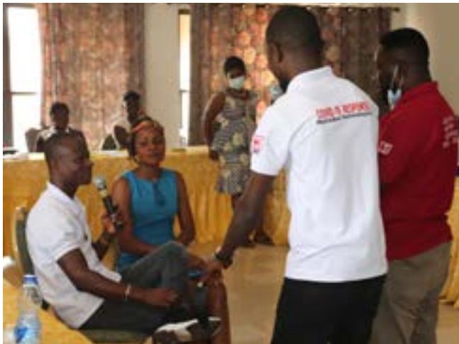
Some vaccine champions demonstrating ways of engaging community members on COVID-19 vaccine acceptance.

Facilitators from the Ghana Red Cross Society, the Health Promotion Department of Ghana Health Service and HFFG commended PACT 2.0 for being a channel to uproot misinformation in the communities which have fueled fear surrounding COVID-19 vaccines. Read more.