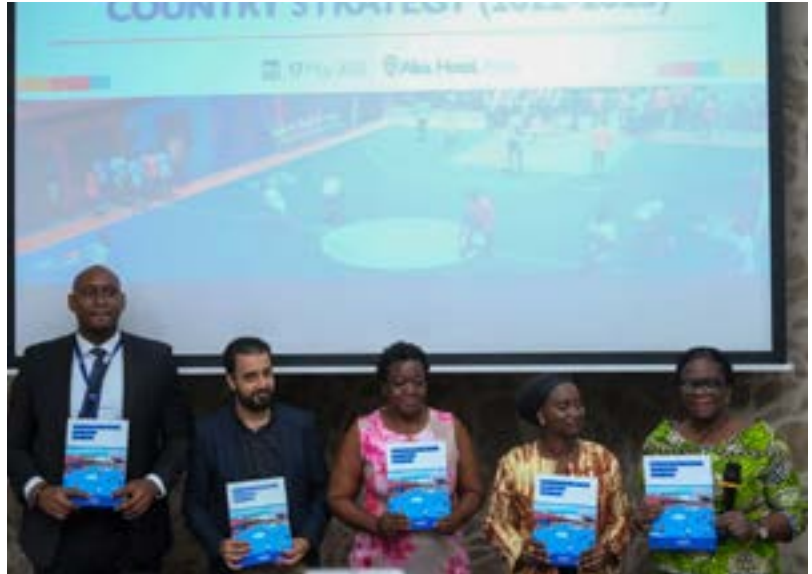
Chief Director of the Ministry of Interior (first right) launching the Country Strategy.

The International Organization for Migration has launched its Country Strategy for Ghana 2022-2025 . The programmatic framework of the new Country Strategy is founded on three main pillars: resilience, mobility and governance. It aims to build the resilience of migrants and their communities of origin; strengthen existing migration management systems so that they are more protection sensitive to mobility-induced vulnerabilities; and reinforce the policy and legal framework for migration governance.