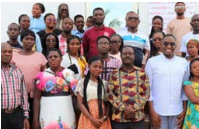
Group picture of Vaccine Champions.