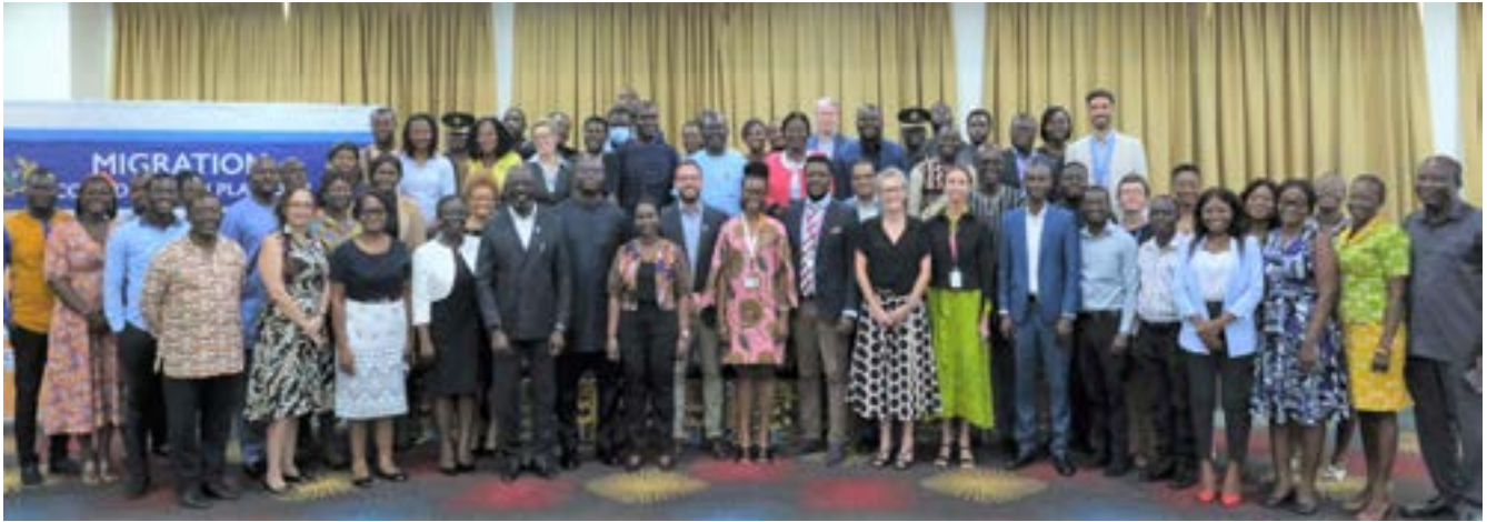
Group photo of Migration Coordination Platform meeting participants in Accra, Ghana

Effective coordination of migration-related issues in Ghana among international development partners and multilateral agencies is key to achieving national and global migration management commitments. The Migration Coordination Platform (MCP) provides the space for key players on the sector to deliberate on migration management matters and ways to improve coordination and collaboration amongst stakeholders.