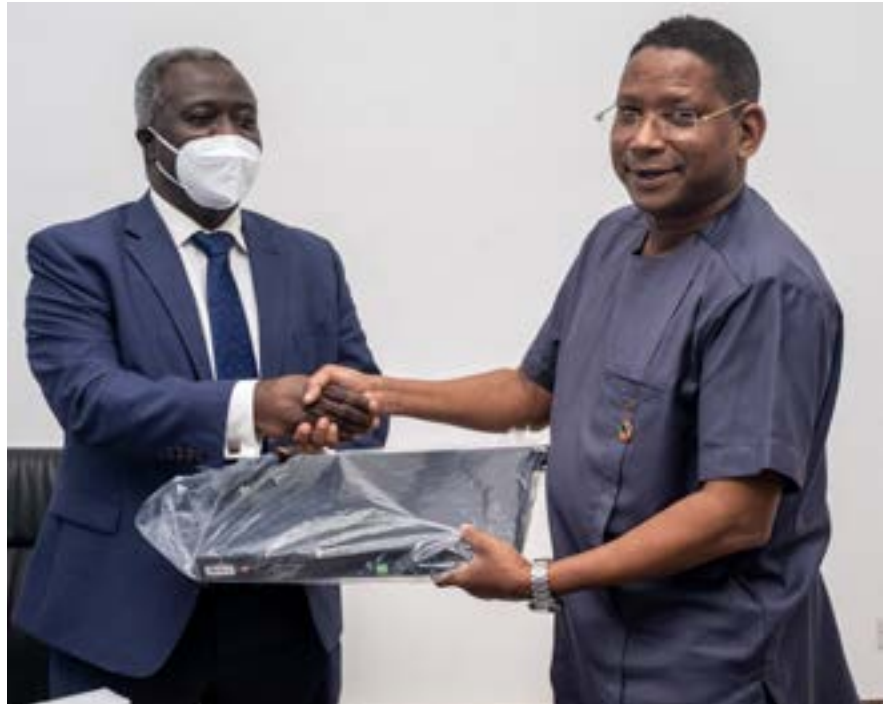
UNESCO Ghana Representative making a presentation to the Vice Chancellor of UHAS.

The ICT equipment will help the university to create, manage, share and publish their own teaching resources. Other universities in Africa that will benefit from the second