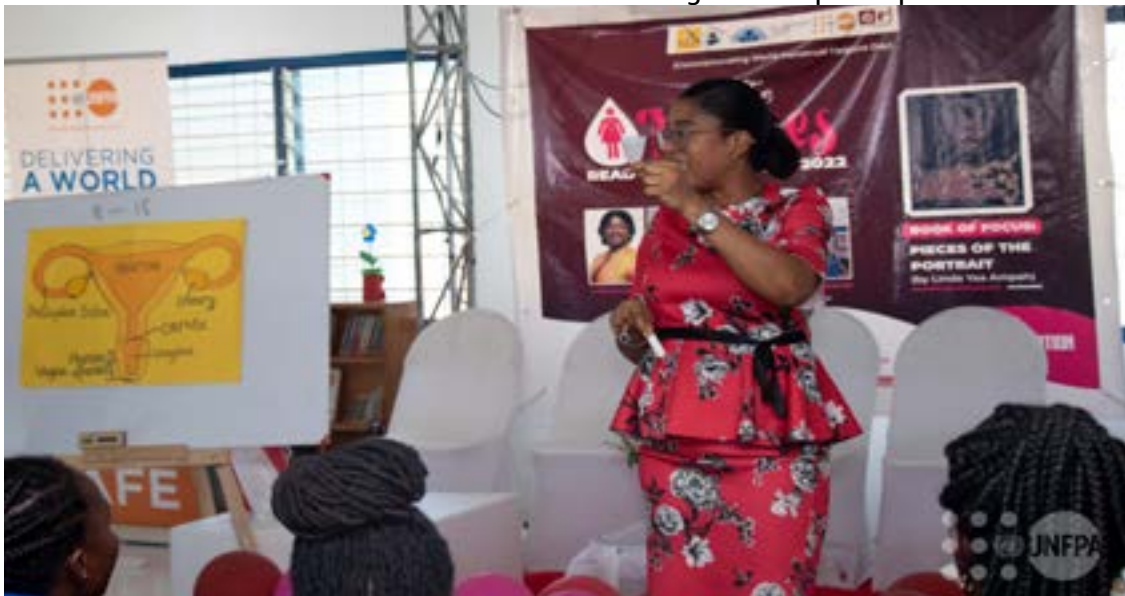
A resource person taking the audience through the cycle of menstruation. (Above). Participants proudly showing off their menstrual pads. (Left).

UNFPA, through the Child Marriage Programme also donated sanitary pads to all the girls who participated in the session. Read more.