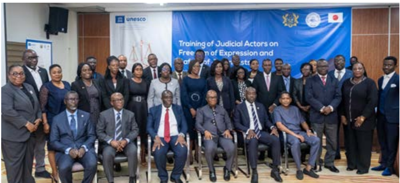
Dignitaries together with trained judges.

international and regional standards on freedom of expression, access to information and the safety of journalists in over 150 countries around the world. Over 23,000 judicial actors, including judges, prosecutors, and lawyers, have been trained on these issues, notably through a series of Massive Open Online Courses (MOOCs), on-the-ground training and workshops for Supreme Court judges, and the publications of toolkits and guidelines.