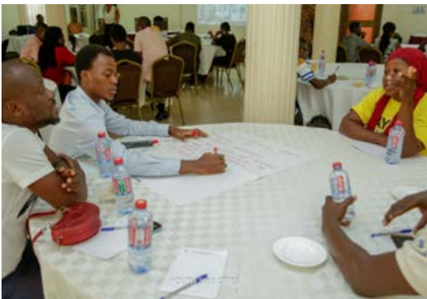
Youth participants in a group working session.

(WUF 11) held in Katowice, Poland in June 2022; It will also inform policy dialogues, regional activities, and global high-level meetings on sustainable urbanization. The