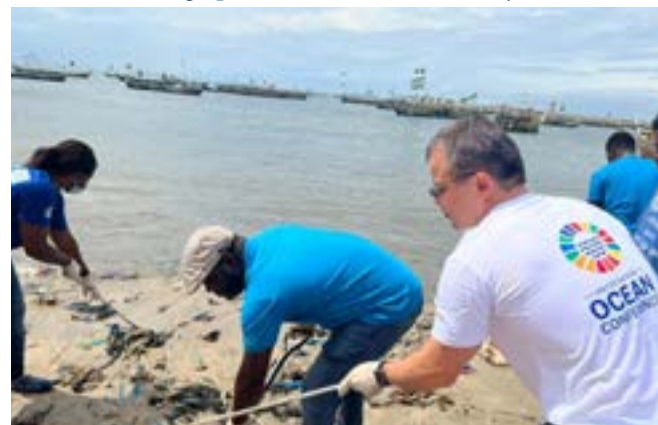
UN staff cleaning up ahead of the Ocean conference.