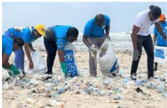
UN staff cleaning up to mark World Ocean Day.

In a blog titled Mobilizing collective action for a sustainable ocean economy , the UNDP Resident Representative, Angela Lusigi calls for collective action, nurtured through partnerships and local action, to save our ocean.