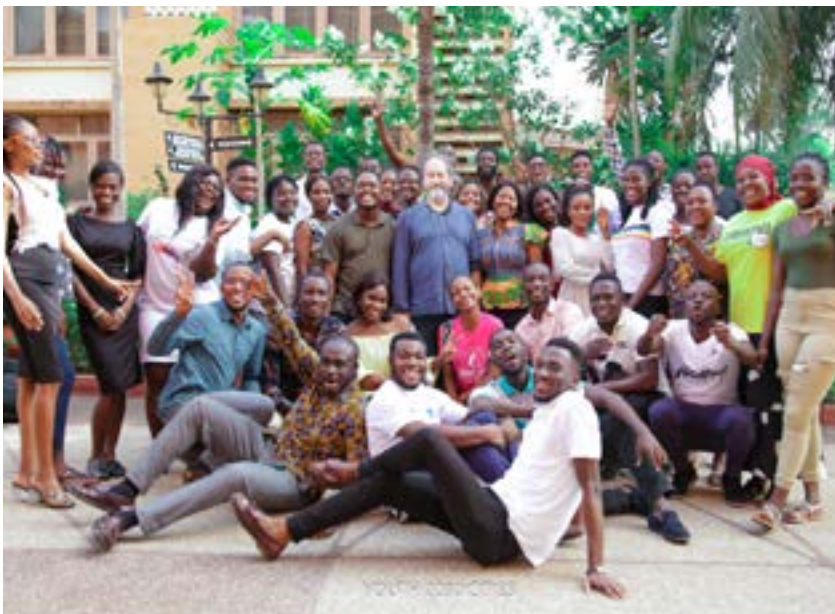
Group photo of participants

The DeclarACTION was integrated into the World Urban Forum