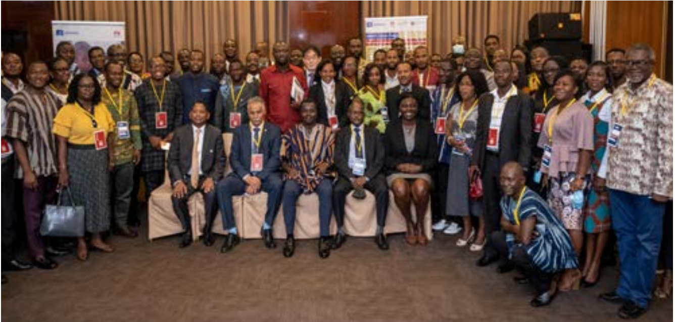
Group photo of dignitaries together with participants at the UNESCO-Huawei Technology-enabled Open Schools for All Project.

tance learning, informed by several recent national events, such as the maiden National Digital & Distance Learning (NDDL) Conference organized by the Centre for National Distance Learning and Open Schooling in Ghana (CENDLOS) held in Accra.