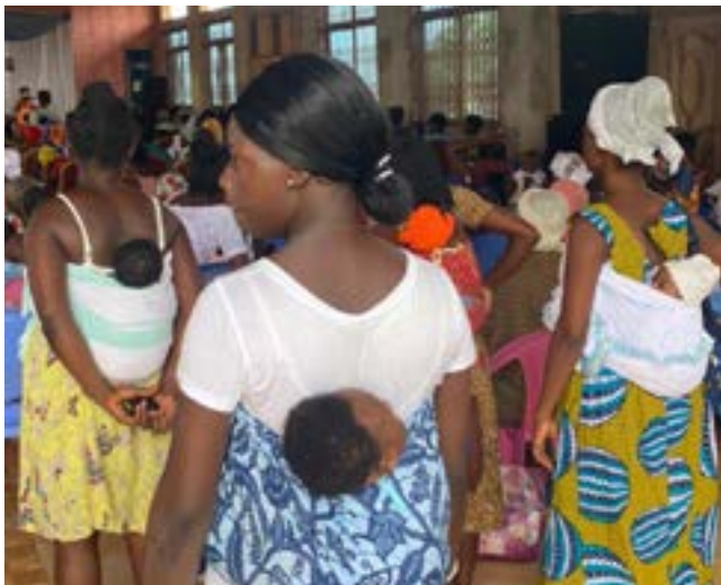
Young mothers at the forum.

The forum reached about 500 pregnant adolescents and teen mothers and was facilitated by nurses from the GHS and Field Officers from Planned Parenthood Association of Ghana. Read more.