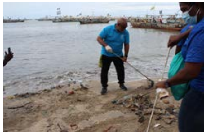
UN Resident Coordinator, Charles Abani cleaning the beach ahead of the Ocean conference.