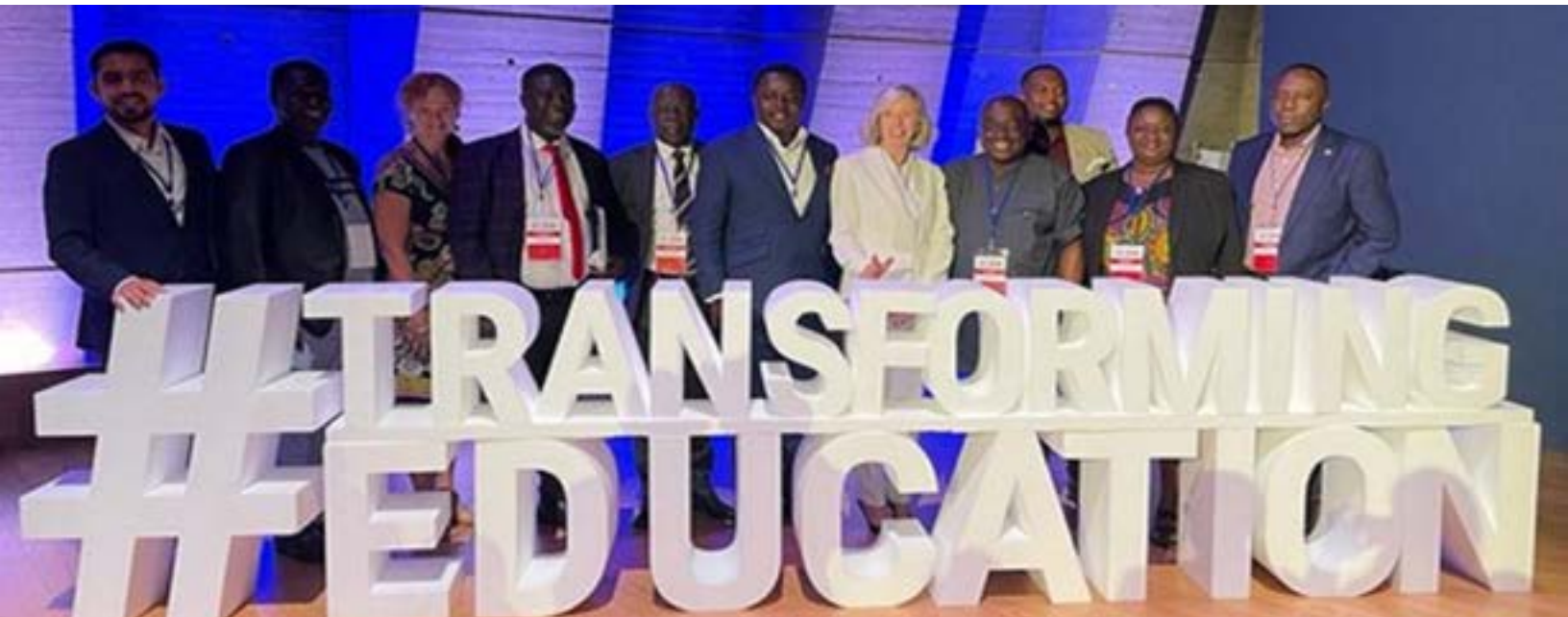
Ghana Delegation with Stefania Giannini (5th from Left), UNESCO Assistant Director General for Education.

In addition to the plenary sessions, the Ghana delegation participated in many side events including Action Track 3 on Teachers, Teaching and the Teaching profession at which time the Hon. John Ntim Fordjour shared information on how Ghana used participatory approaches to develop the Comprehensive National Teacher Policy (CNTP) to transform the teaching profession in the country. The delegation also held bilateral meetings with some senior UNESCO officials to deepen the existing cooperation between Ghana and UNESCO as well as explore new areas of cooperation geared towards attaining the SDGs.