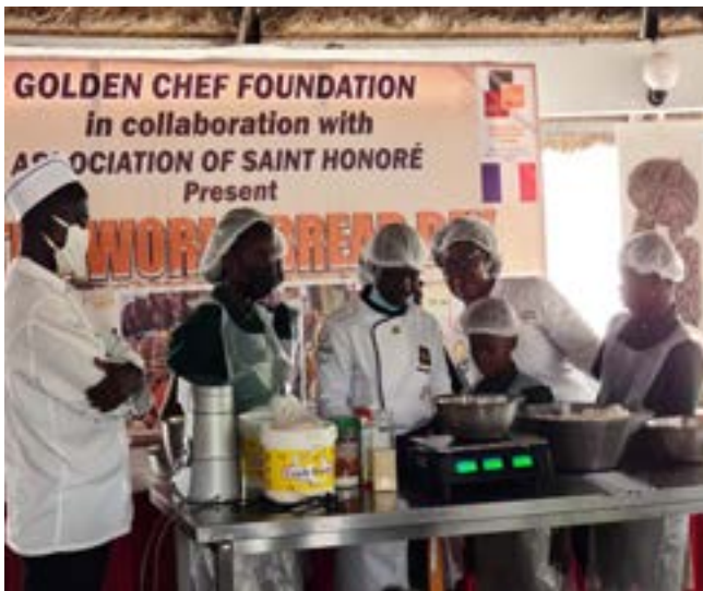
Some school children learning about how bread is made

Visitors at the Fair were sensitized about bread and the process of making bread, one of the most consumed foods in the world. Read more.