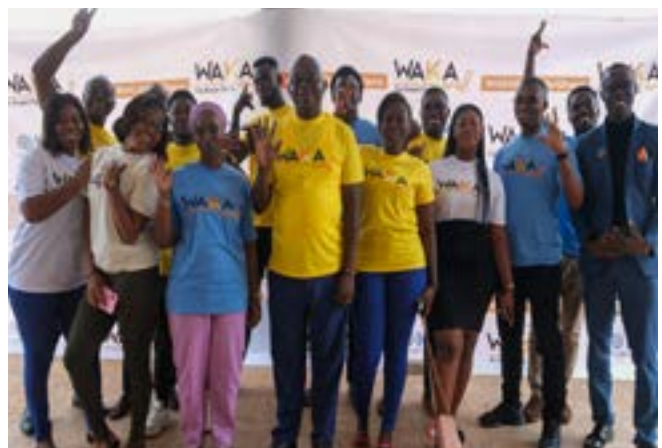
Young people present in a group photo with IOM Chief of Mission.

and tailored information on migration pathways for countries and information about local opportunities including education, professional training, business development and employment available in these communities. Read more.