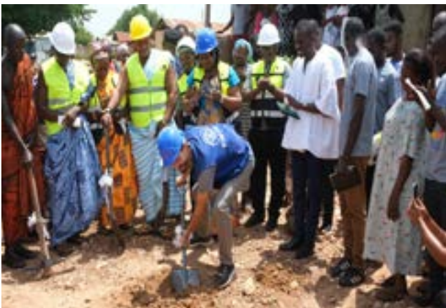
Cassava Processing Factory groundbreaking in Adamu.

associated with irregular migration. The Campaign includes a series of videos highlighting migration experiences and individual definitions of success. It also features an online platform, WAKAwell.info/Ghana , which provides reliable