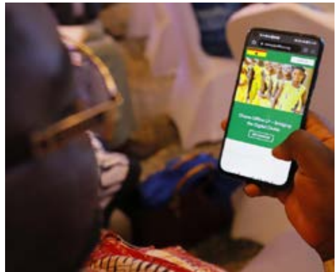
The Learning Passport App being used at the D2 Learning Conference.

Following the CENDLOS conference, UNICEF facilitated post-conference Learning Passport content mapping exercise with a diverse group of digital and distance learning stakeholders.