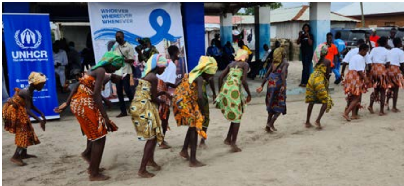
Some refugee and host community children dancing during World Refugee Day event in Ampain Camp.