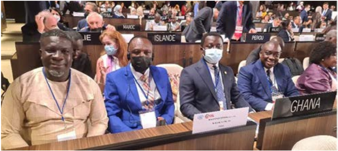
Ghana Delegation at the High-level Ministerial Session.

As part of its support to the Government of Ghana in preparing for the pre-summit and the main summit, the UN System in Ghana has prepared a position paper that highlights the key education sector issues