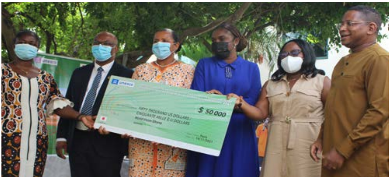
Officials from World Vision Ghana proudly display their award of $50,000

outstanding literacy project, " Unlock Literacy Project ", that seeks to improve children's core reading skills.