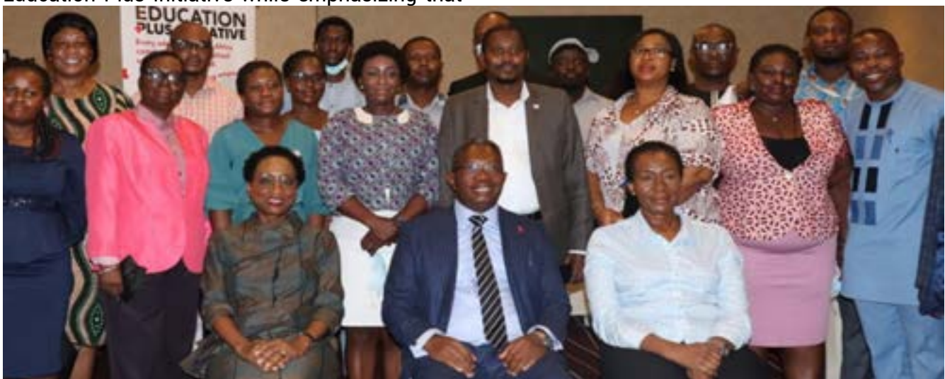
Group picture of participants at the Education Plus stakeholders meeting

The meeting brought together thirty participants comprising of high-level representatives from the Ministries of Education, Gender, Children and Social Protection, Youth and Sports, the Ghana National Population Council, the Ghana Coalition of NGOs in Health, Child Rights International, the Ghana AIDS Commission, UN agencies and youth advocates.