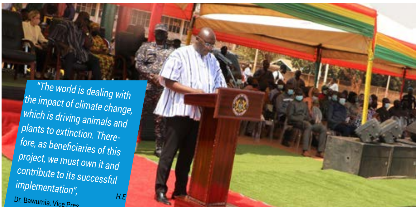
The Vice President of the Republic of Ghana, Dr. Mahamudu Bawumia at the launch of the project.