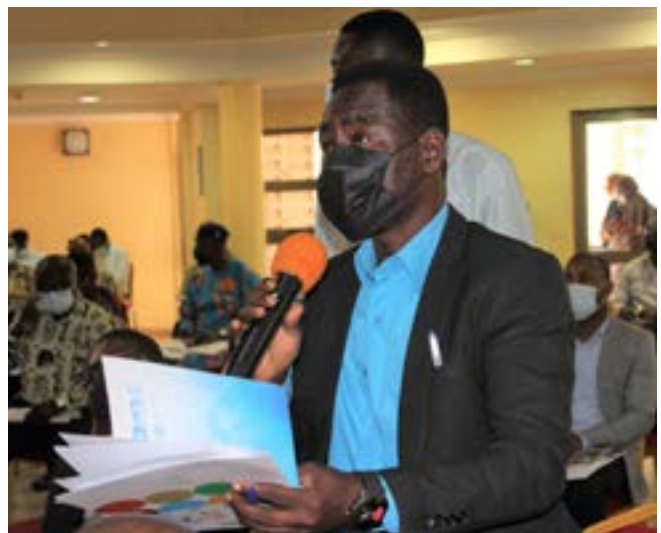
A participant making a submission at the review & validation meeting with key stakeholders.