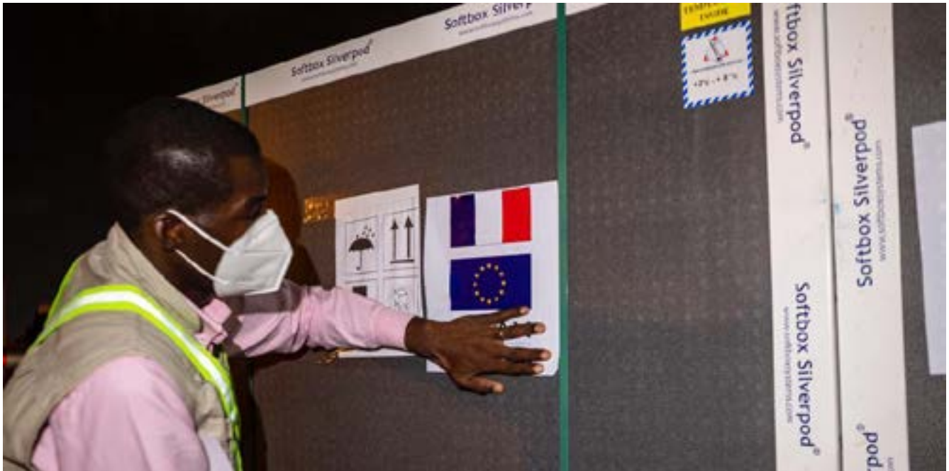
ABOVE: Inspection of the consignment at the Kotoka International Airport

ensuring availability of more vaccines and equal access to all. UNICEF and WHO joined the Government of Ghana and partners to take delivery of the vaccines and ensure safe delivery.