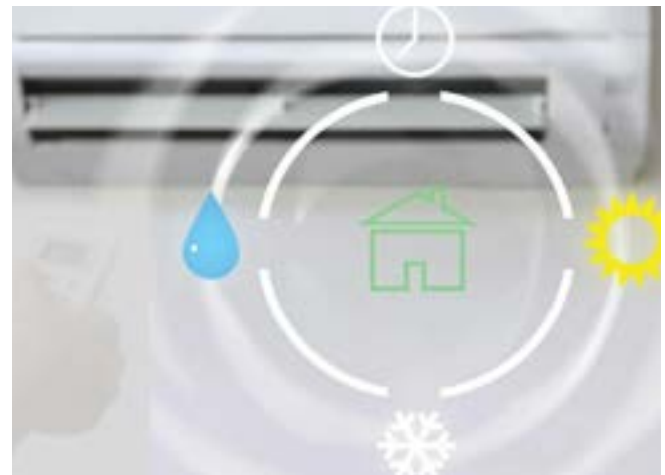
Flood in Accra.