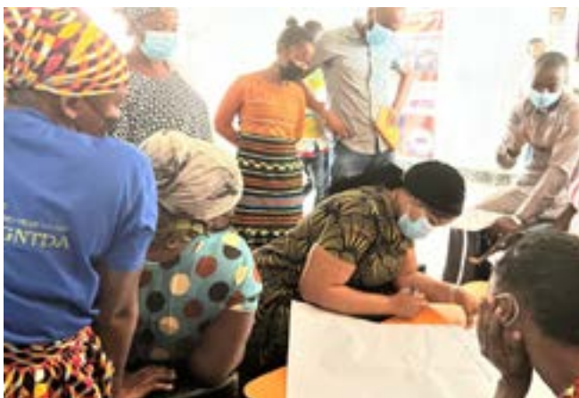
Women and youth co-creating solutions to bridge the gender inequality gap in Ghana

In this regard, about 250 women and youth participants in five selected districts where UNDP has been providing COVID-19 recovery support to the local assemblies, benefited from a leadership and advocacy training. The participants included assembly women and aspirants, representatives of queen mothers, youth groups, and other relevant community leaders/members, and persons with disability. The participants were engaged in discussions on the extent to which society expects women to behave a certain way, and how this limits their ability to perform their duties. The participants were also encouraged to share their experiences regarding the gender inequality gap, and how they can work to bridge the gap in their communities. Read more.