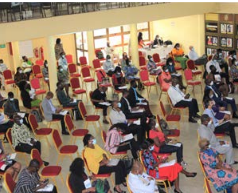
A cross-section of the audience at the review & validation meeting with key stakeholders.

The process to develop a new Cooperation Framework is articulated in, and driven by, the Cooperation Framework Roadmap developed by the Resident Coordinator's Office in consultation with the UNCT and key stakeholders (Government, Civil Society, Development Partners and Private Sector). A UN-National Joint Steering Committee (JSC), co-chaired by the Resident Coordinator and a representative from the Ministry of Finance, has been established to oversee the roadmap process and Cooperation Framework implementation. The JSC includes Government representation (MoF, NDPC, MoFARI) as well as Civil Society (Ghana Civil Society Platform on the SDGs)