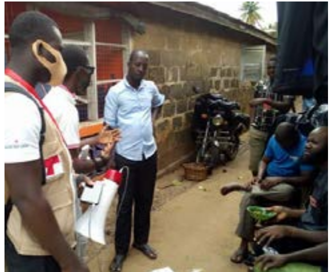
Volunteers engaging some members of the community.

At the end of the campaign, 407,583 people were reached with COVID prevention and vaccine uptake messages.