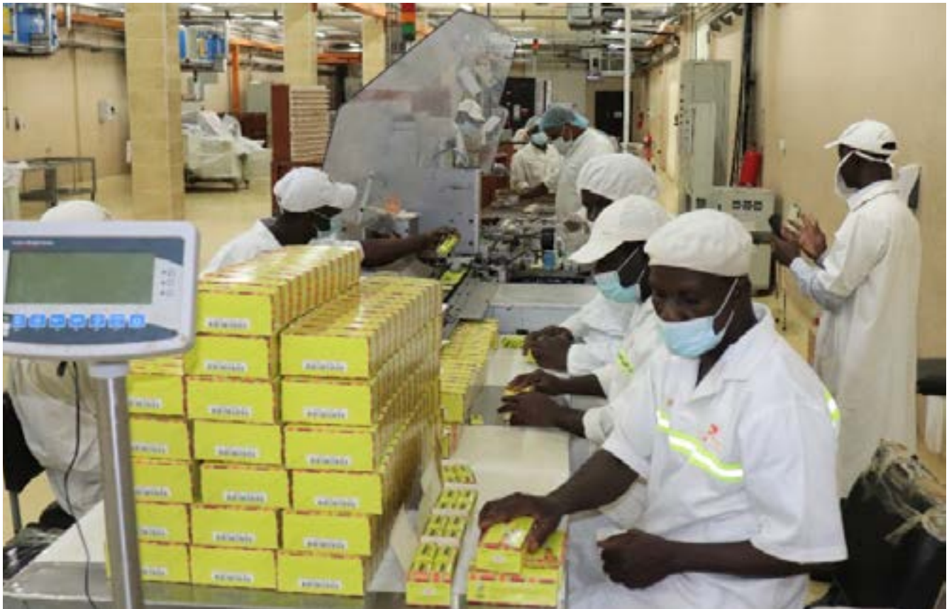
Businesses in Ghana are recovering from COVID-19 shocks.

A collaboration between the Ghana Statistical Service, UNDP, and the World Bank, as part of the