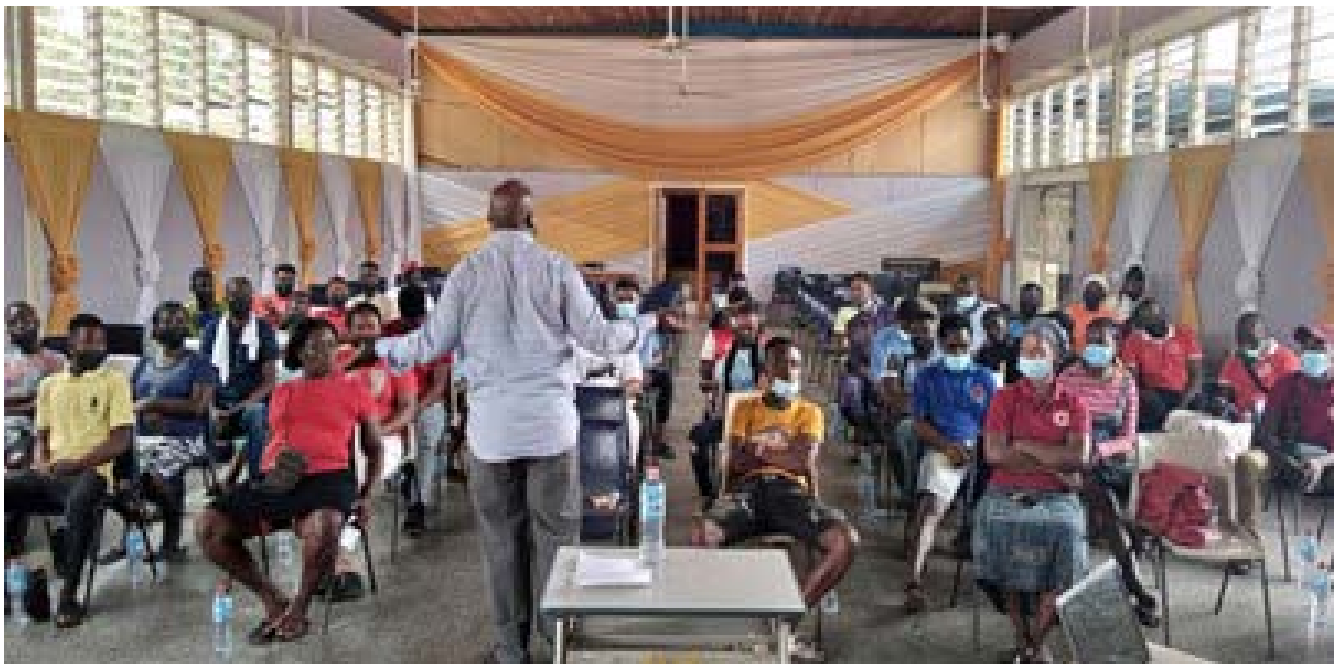
Orientation session for volunteers.