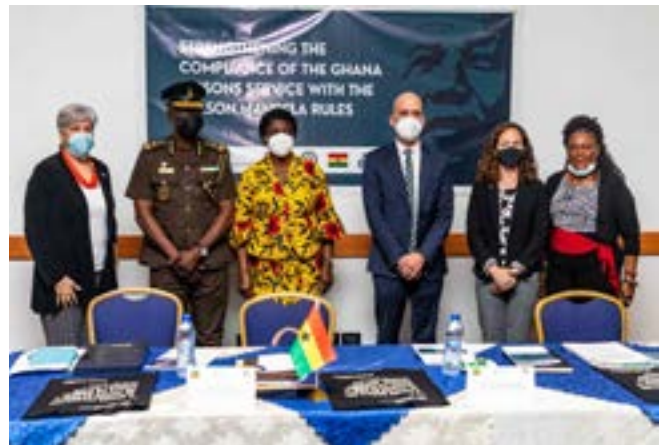
Officials at the launch of the project

Funded by the Bureau of International Narcotics and Law Enforcement Affairs (INL) in the State Department of the United States of America, the project will focus on improving prison conditions, including health and basic services, the classification, categorization and allocation of prisoners as per their individual risk and needs and on enhancing prisoners' access to sustainable rehabilitation programmes. Read more.