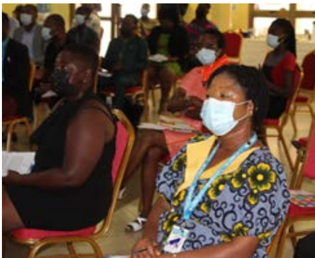
A cross-section of the audience at the review & validation meeting with key stakeholders.