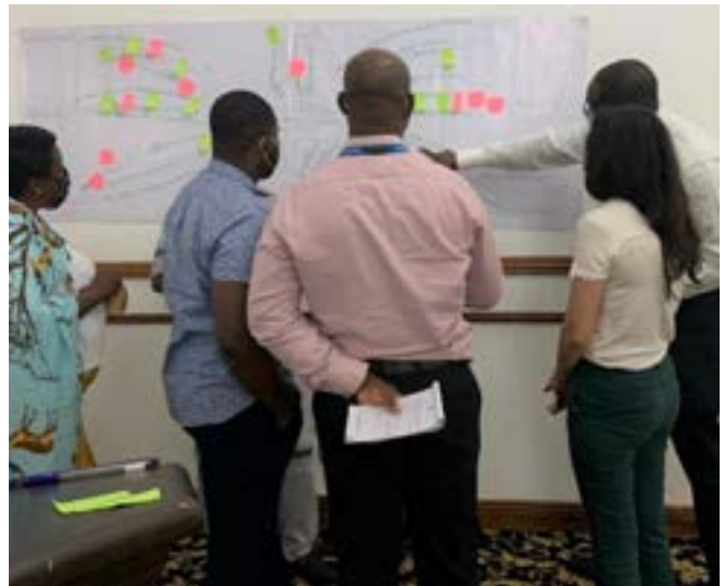
ABOVE & BELOW: UN Technical Team at the Theory of Change session

It is anticipated that the new Cooperation Framework, following multi-stakeholder consultations under the guidance of the JSC, will be ready for implementation within quarter three (Q3) of 2022. We will continue to provide updates as this process progresses.