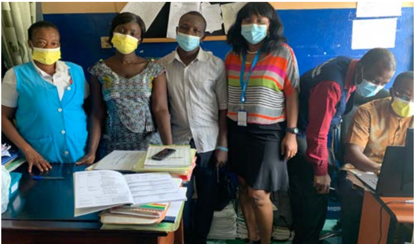
Some health workers and WHO officials at the differentiated service delivery project in the Volta region.

The two main lessons learned from the project were: Firstly, Community-led monitoring is achievable with capacity-building of the community of people living with HIV and it is valued by service providers; Secondly, running a successful viral load programme requires regional leadership, partnership with the PLHIV community and reliable lab equipment and reagents. Findings from this project and lessons learned were shared during the HIV/TB annual review meeting held on 18th February.