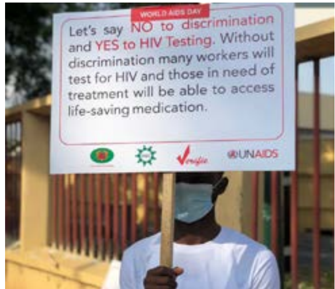
ABOVE: A volunteer holding a placard on the street. BELOW: Dignitaries at the WAD national event.

On World AIDS Day, Ghana joined the rest of the world to mark the Day with advocacy, street sensitization initiatives and a national public event to intensify messaging to end complacency and to deal with inequalities. The Day also provided an opportunity to tell the positive stories of how UNAIDS, the Ghana AIDS Commission and partners are working together to end AIDS.